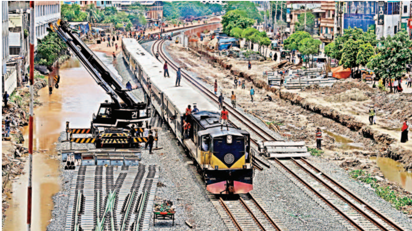
A train heading towards Narayanganj from Kamalapur Railway Station yesterday. The Dhaka-Narayanganj rail link, which is part of the Padma Rail Link project, was reopened yesterday after being closed for nine months for development work. The photo was taken in Gendaria area.

Kazi Habibul Awal Chief Election Commissioner