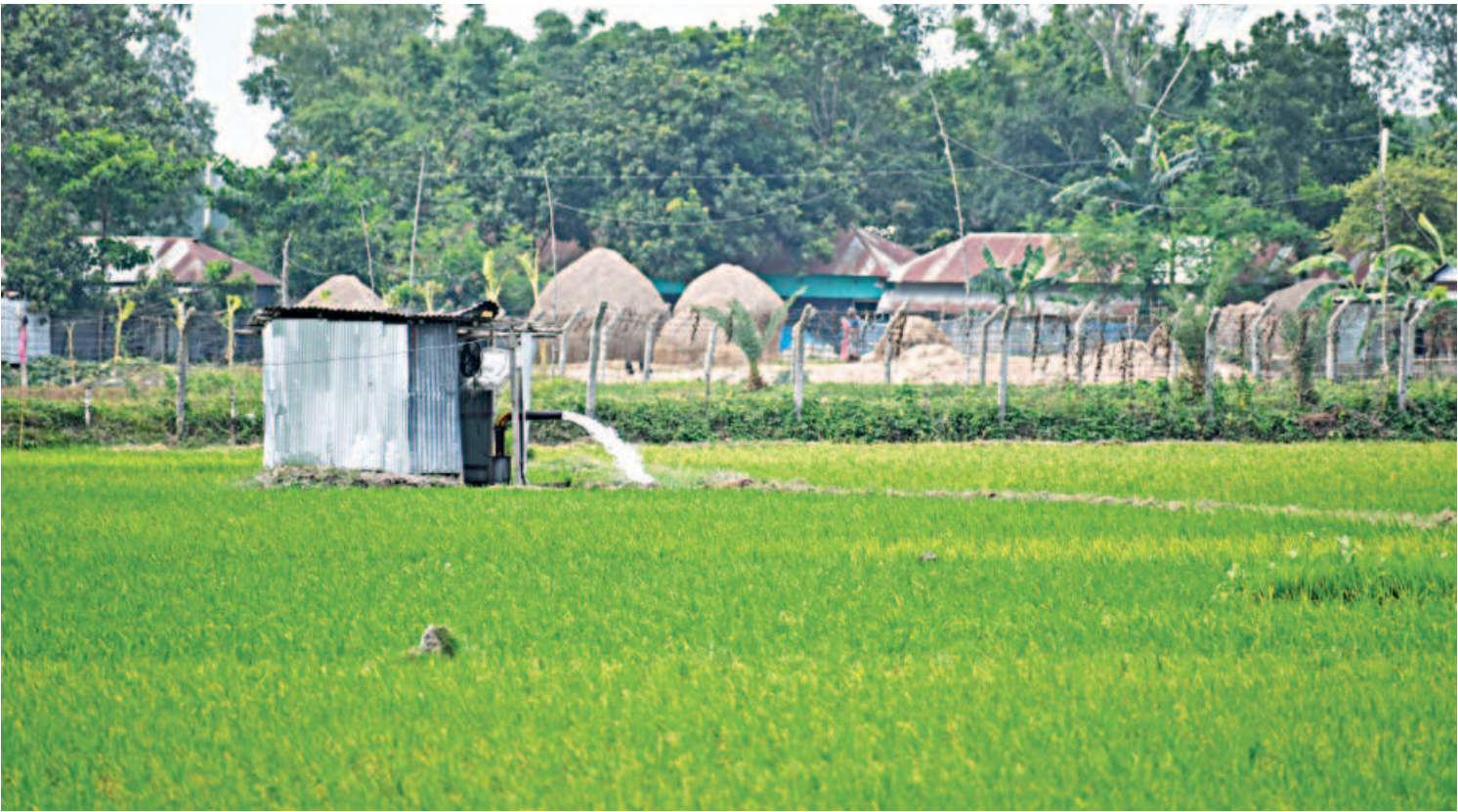
The lack of sufficient rain amid the ongoing Aman season is forcing farmers to make use of irrigation pumps for their paddy saplings, driving up the overall production cost. The picture was taken from Gobindaganj upazila of Gaibandha yesterday.