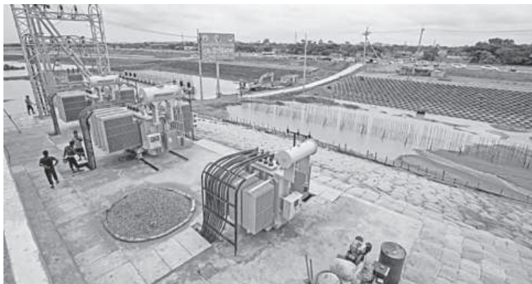
The Bay Terminal is being constructed on around 2,500 acres of land. It will have a length of 6.15 kilometres, stretching from the backside of the Chattogram Export Processing Zone to Rasmonighat on the Halishahar coast of the Bay of Bengal.

As part of the railway project, BR planned to build a 4km line at a cost of Tk 142 crore to connect the terminal with Chittagong Goods Port Yard (CGPY) at the port city's Halishahar area. But following the study, the BR officials said railway line will be 1.2km long.