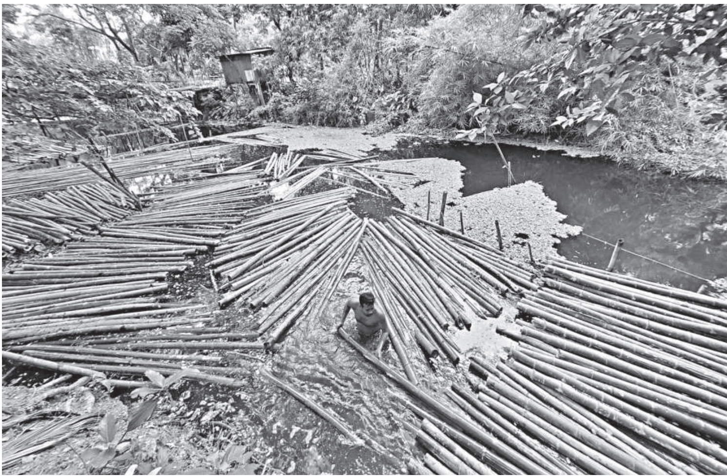
A man organises bamboo canes that remain submerged in pond water. Local traders bring in these canes from Madaripur and keep them in the water for around 10 days before they are cut into thin sticks used for barricading and providing support to betel leaf plants. This photo was taken in Sujankathi of Barishal's Agailjhara upazila.

BR in December last year suspended train operation on this route to facilitate the work of the Padma Bridge Rail Link Project (PBRLP). Under the PBRLP project, a 169km rail line is being built from Dhaka's Kamalapur to Jashore.