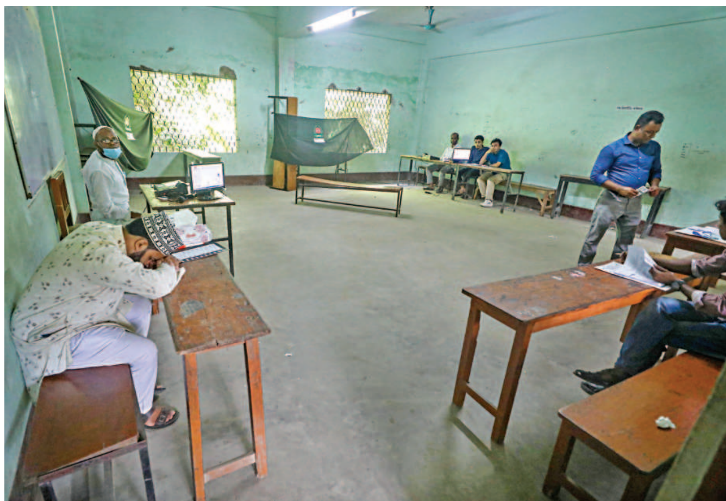
An election official dozes off on his desk, while the others have no work, as the Probartak School and College voting centre in the Chattogram-10 by-polls remained devoid of voters till at least 10:00am yesterday.