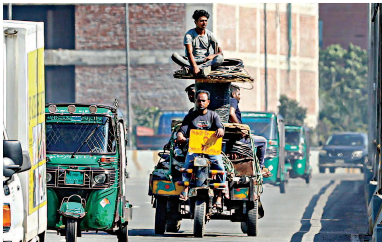
CIRCUS ACT! ... While four people - the driver, two passengers behind and one carrying cables on the roof - can be seen on this illegal three-wheeler plying the port city's Akhtaruzzaman Flyover, there are about 11 others sitting on a detachable portion at the back (not in photo). Driving such a vehicle was already unlawful and with so many passengers, the risks are manifold. The photo was taken yesterday.