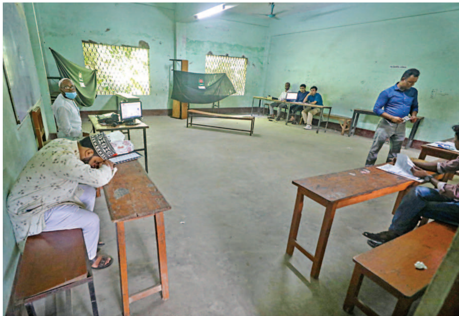
An election official dozes off on his desk, while the others have no work, as the Probartak School and College voting centre in the Chattogram-10 by-polls remained devoid of voters till at least 10:00am yesterday.