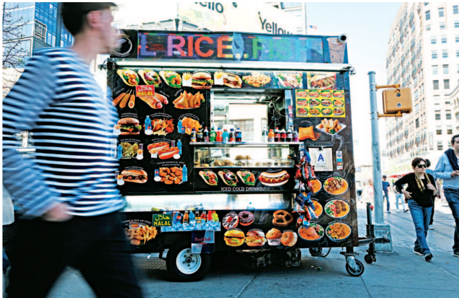
People walk by a food cart in Manhattan, New York City. Excluding the volatile food and energy components, the PCE price index of the US rose 4.1 percent from a year ago last month, easing from May's 4.6 percent rate.