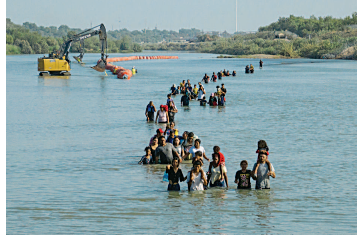
A caravan wades past a string of buoys, being constructed to deter migrants crossings through the Rio Grande river, as they look for an opening in the concertina wire to enter into Eagle Pass, Texas, US n Thursday.

"They stabbed knives into their chests. They cut out their tongues," the villager told AFP, adding that at least five houses had been burnt down in the incident and people arrested.