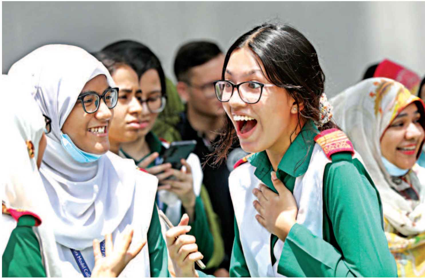
OF LAUGHTER AND RELIEF.. Friends share a moment of joy together, grinning ear-to-ear upon achieving the coveted GPA-5 in SSC examinations. Their hard work and dedication had paid off, as the achievement marked a proud milestone in their academic journey. This photo was taken in Rajuk Uttara Model School and College yesterday.