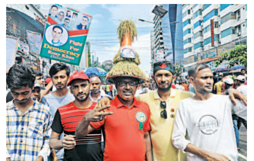
Clockwise from right, Dhaka transformed into a city of rallies yesterday. Prior to that, law enforcers set up checkpoints at the capital's entry points on Thursday night, which remained in place till the afternoon. The three associate bodies of the ruling Awami League held a "peace rally" near the south gate of Baitul Mukarram. BNP organised its "grand rally" at Nayapaltan around the same time.