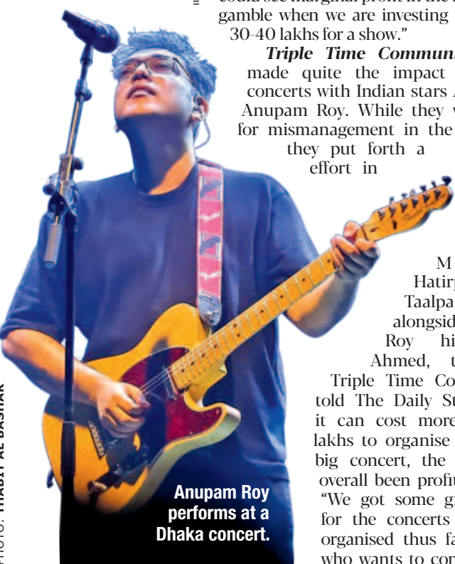
Anupam Roy performs at a Dhaka concert.