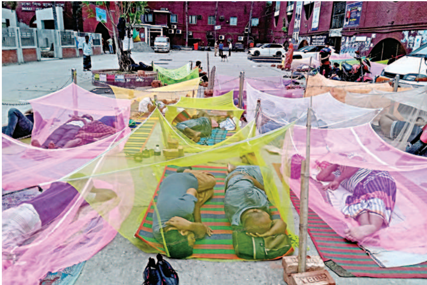
Attendants of child dengue patients at Dhaka Shishu Hospital put up mosquito nets to sleep in the parking area of the healthcare facility, as there is a lack of space for them inside. Many of them have come from distant corners of the country and are scared of catching the viral disease themselves. The photo was taken around 5:00am yesterday.