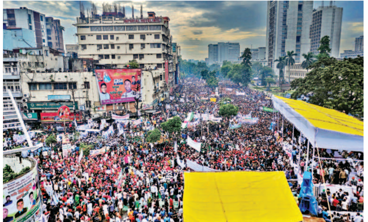
Thousands of Jubo League, Chhatra League and Swetchhasebak League leaders and activists join "peace rally" at the south gate of Baitul Mukarram in the capital. The Awami League and its affiliates later announced they would not hold any rally in the capital today, adhering to police measures.