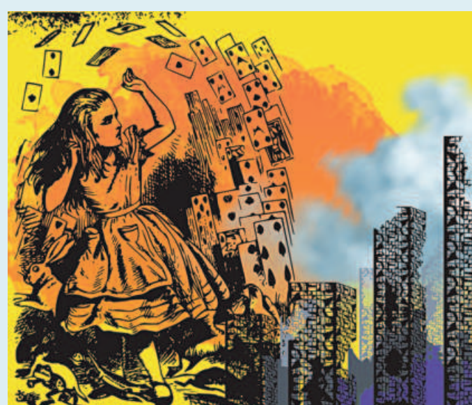
ILLUSTRATION: MALISHA SYEDA

It again subsides, surrendering to sudden uprisings—the tyrant has fallen,