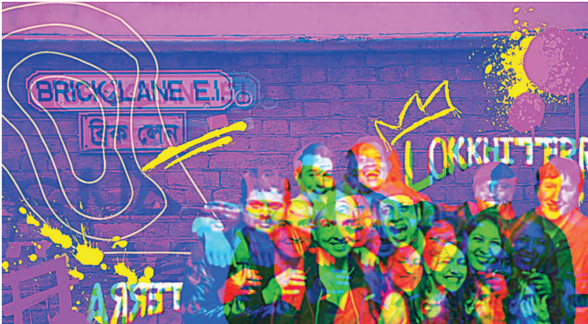
DESIGN: AMREETA LETHE

My quiet affective registers are that of resilience, and to not give up or give in. This unfamiliar version of me wants to create space, not just to wiggle, but to dance in a romantic night of self.