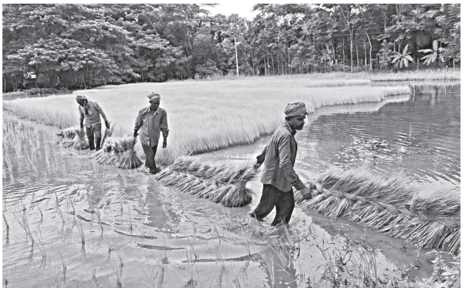
Three men collect Aman paddy seedlings in Karapur area of Barishal Sadar. They said they make around Tk 600 every day for the work, which begins at 7:00am and ends with the setting of the sun. The seedlings are usually planted during monsoon and later transferred to other arable lands. This photo was taken recently.

The board's pass rates from 2011 to 2020 are 84.65, 85.96, 87.31, 93.95, 88.65, 88.67, 86.39, 81.48, 79.62, and 82.34 percent respectively.