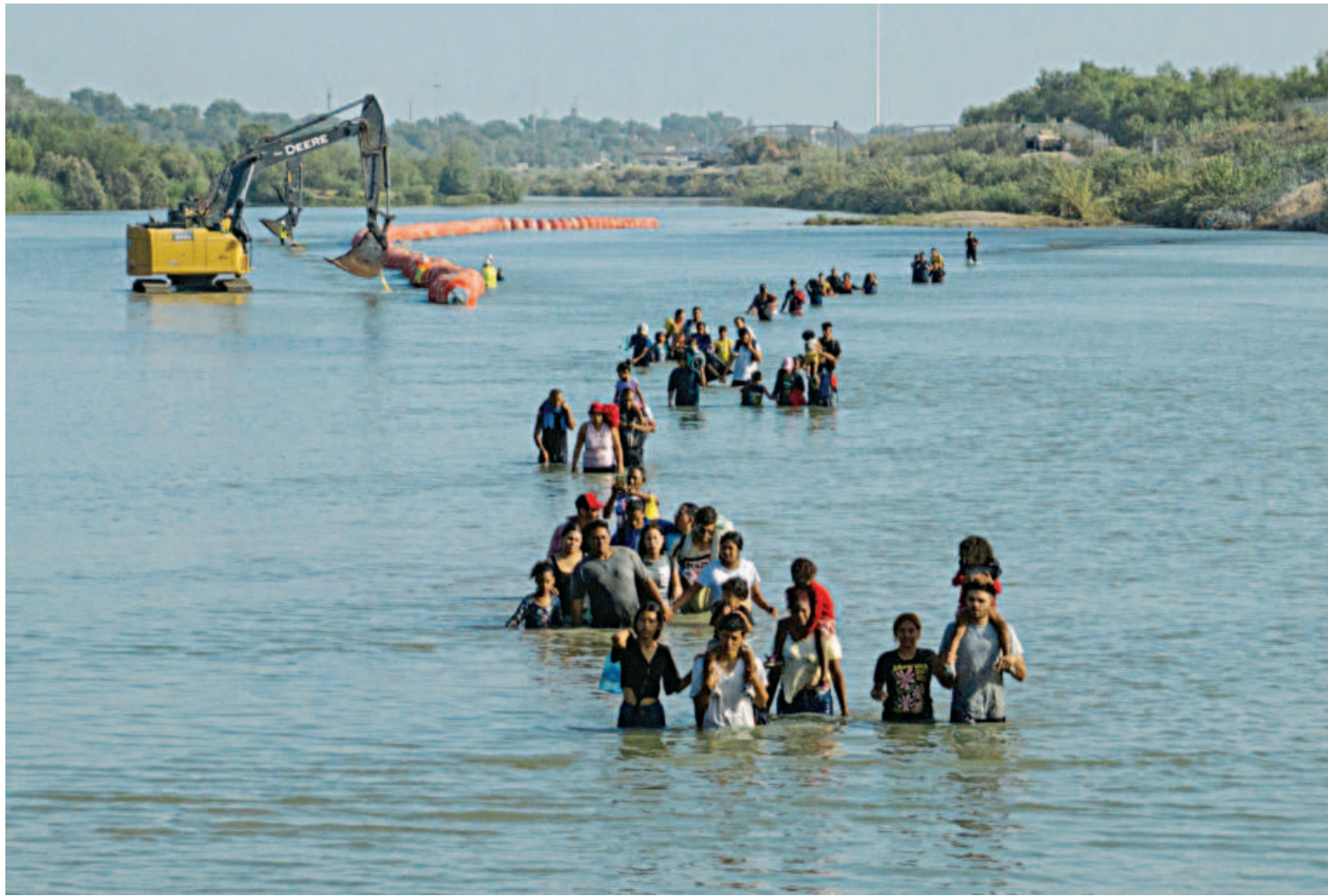
A caravan wades past a string of buoys, being constructed to deter migrants crossings through the Rio Grande river, as they look for an opening in the concertina wire to enter into Eagle Pass, Texas, US n Thursday.

The EU's Environment Commissioner criticised the outcome of the meeting in the Indian city of Chennai, which he said showed G20 countries were "nowhere" on their commitments to address climate change.