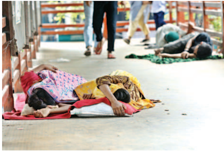
With no access to mosquito nets, many street children spend nights on sidewalks and footbridges in the capital, exposing themselves to dengue.