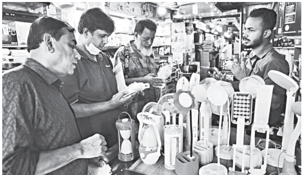
People gather at an electronics shop to purchase rechargeable battery-powered fans during a countrywide heatwave amid power cuts in Dhaka, Bangladesh, on June 6, 2023.

Humans are amazingly adaptable creatures, but there are limits to their adaptability. We can save ourselves from ferocious cyclones by moving to designated shelters. We