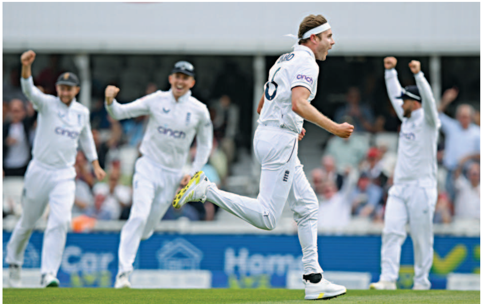
England pacer Stuart Broad celebrates the dismissal of Australia's Travis Head on the second day of the fifth Ashes Test at The Oval in London yesterday. Broad took two wickets as England fought back in the match, reducing the visitors to 186 for seven at Tea with the hosts leading by 97 runs.

When it comes to West Indies, there is a lot of room for improvement at the moment. Their batting unit once again failed to deliver and nothing seems going in their favour. Gudakesh Motie tried to create some sort of impact but the batters didn't give him enough runs to defend. They lack a bit of motivation as well and hence, the team management will have to step up in order to bring some momentum back.