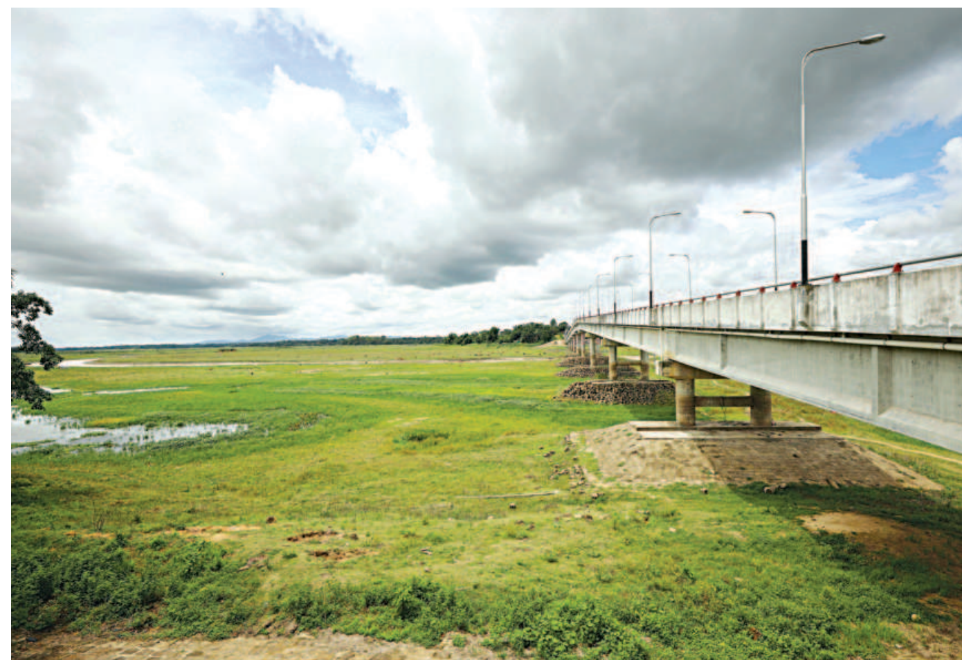
The narrow stream in the distance is all there is left of the Chengri river in Rangamati's Naniarchar. Poor rainfall upstream has almost completely dried up the river, a key water source for the Kaptai Lake. The photo was taken recently.

"The exceptional discovery is an important example of the shipwreck of a Roman ship facing the perils of the sea in an attempt to reach the coast, and bears witness to old maritime trading routes," the Carabinieri said.