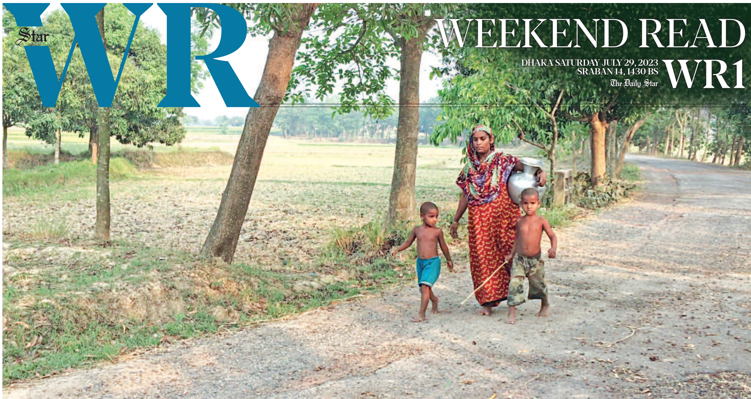
Many have to walk miles under the scorching sun to access water. This photo was taken in Nachole upazila of Chapainawabganj recently.