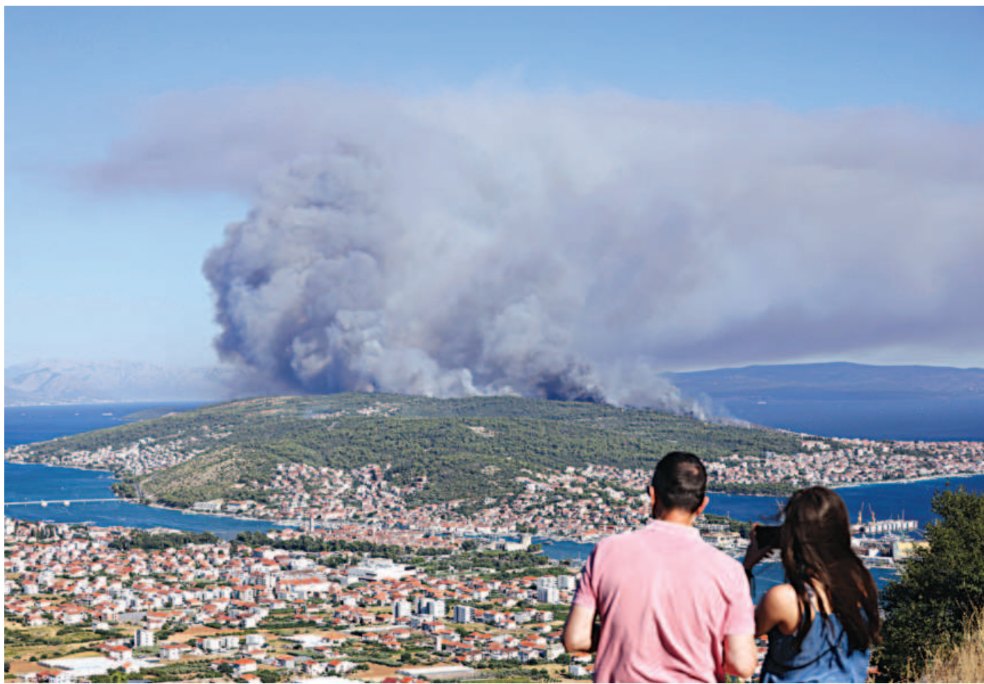
People watch the wildfire on the island Ciovo, from Seget Gornji, Croatia.