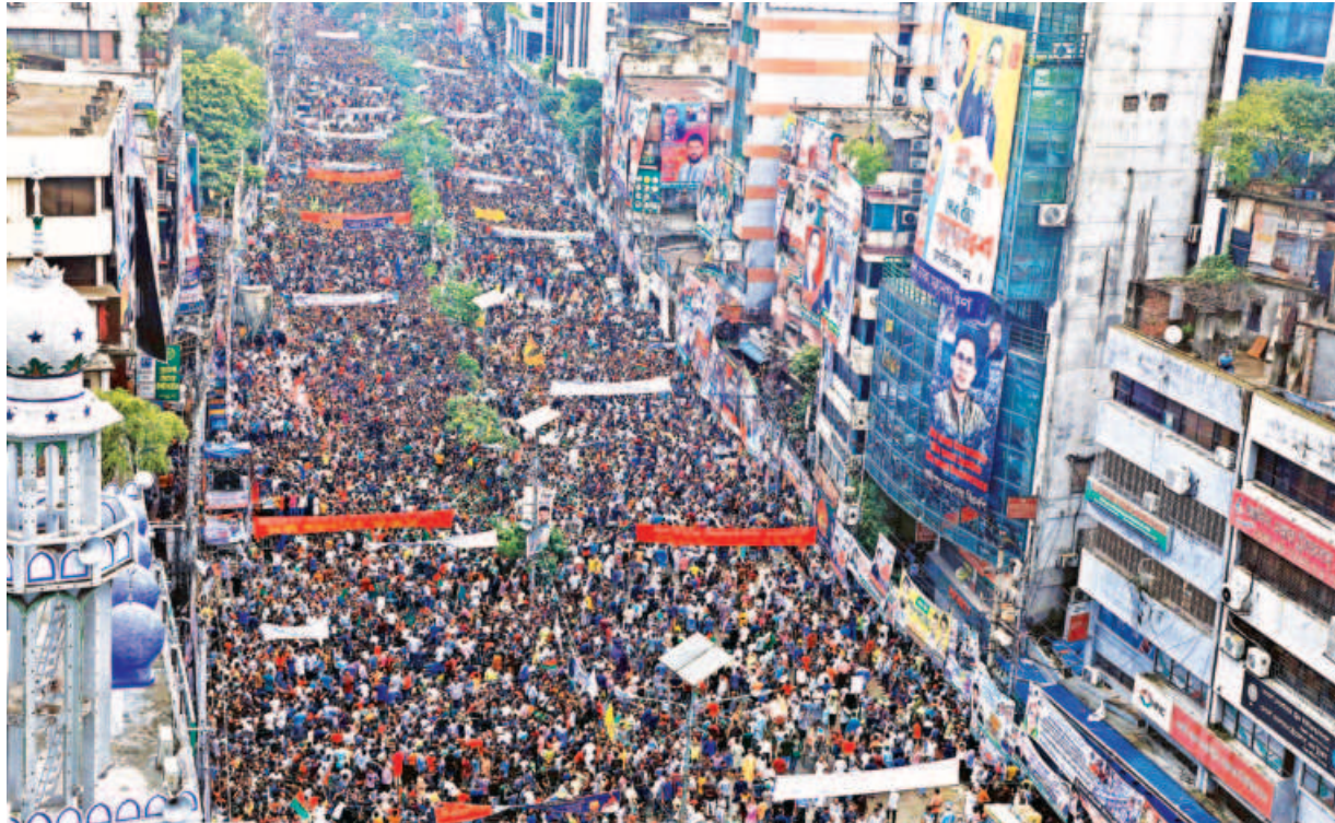
A shot of the BNP's grand rally in front of its Nayapaltn headquarters yesterday afternoon. The party announced that it would hold sit-ins at all entries to Dhaka today to press for its one-point demand for resignation of the government and polls under a non-party interim government.

Will continue presidential campaign if sentenced