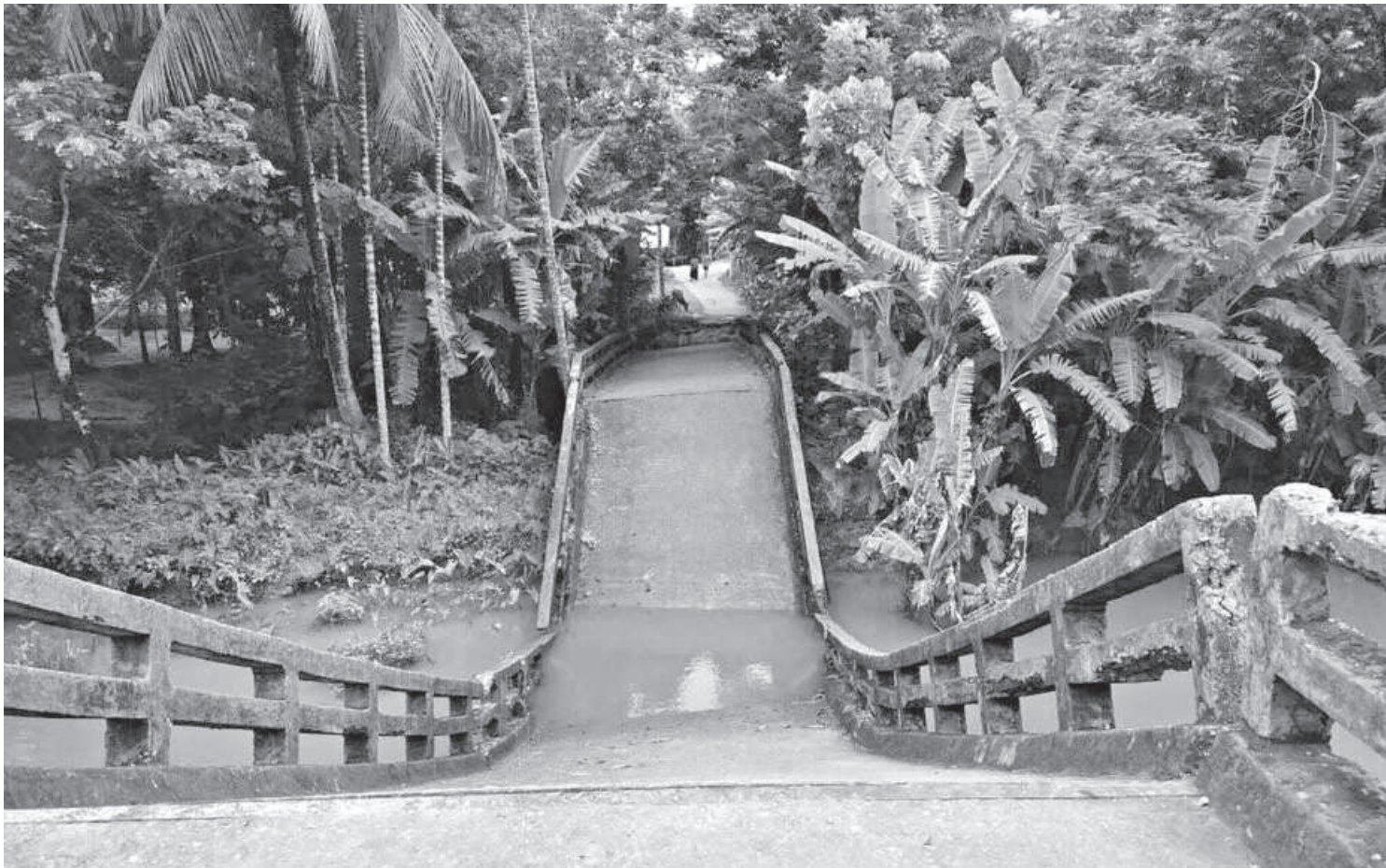
More than 100 bridges constructed over various canals in Barguna remain dilapidated due to a lack of maintenance. As a result, locals, especially workers and students, continue to suffer.

Dr Kano is the professor emeritus of the Tokyo University of Science. He is the founder chairman of the Asian Network of Quality.