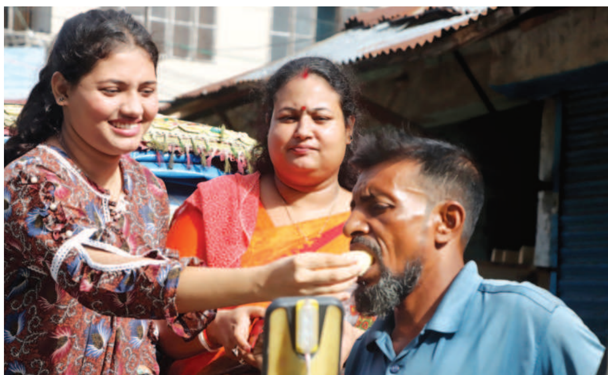
With a big smile, an SSC examinee treats her rickshaw-puller with sweets on her way back home from her school after the result of this year's SSC and its equivalent exams was published yesterday. The photo was taken in Barishal city's Nazirpool area.