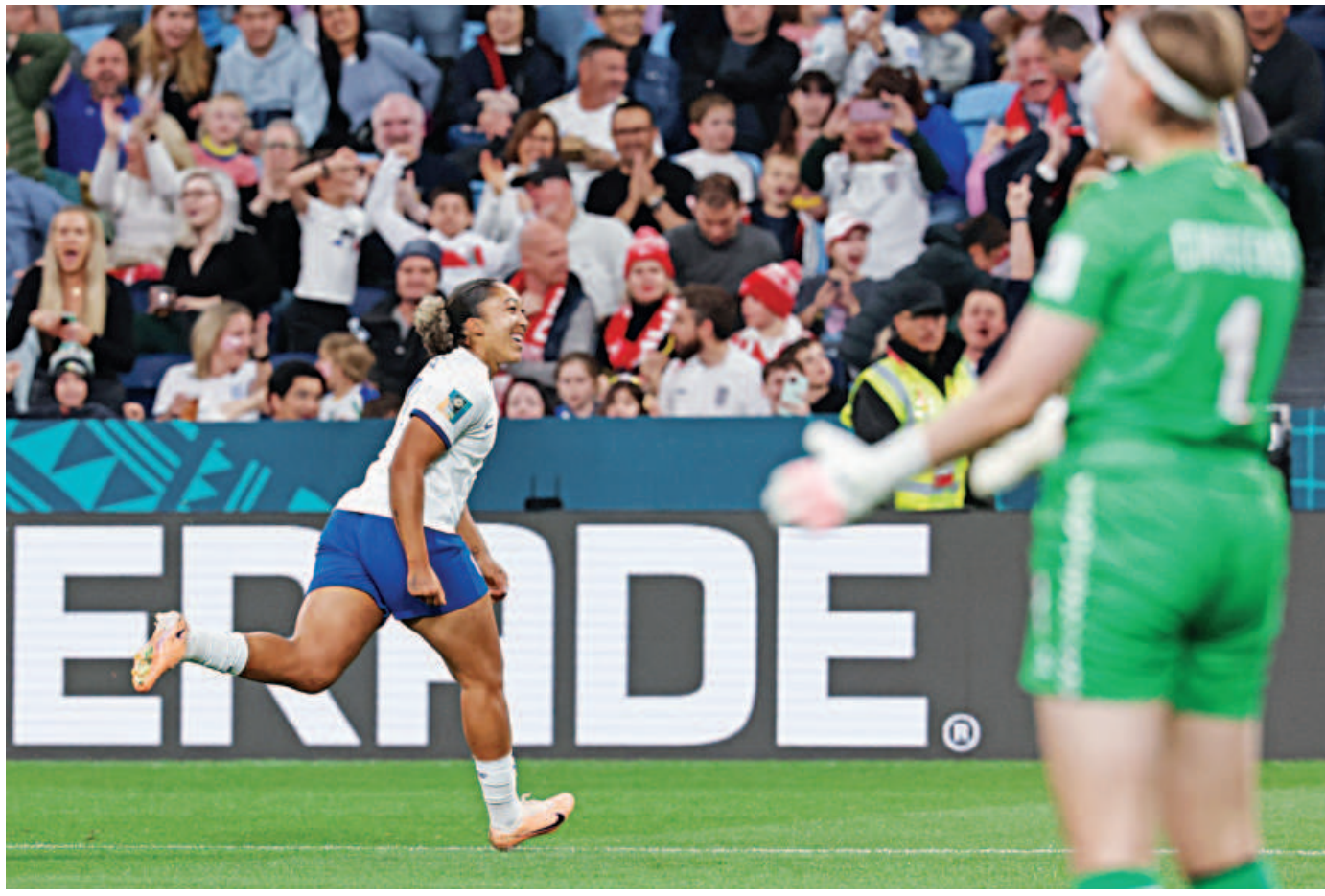
Lauren James scored a wonder strike in her first Women's World Cup start to lead England to a 1-0 Group D victory over Denmark on Friday, all but guaranteeing the European champions a spot in the knockout stage. James sped past one defender and then curled in a rocket from 22 yards out in the sixth minute that goalkeeper Lene Christensen had little chance of stopping at Sydney Football Stadium.