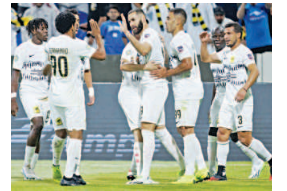
Karim Benzema's journey with Saudi Arabia's Al-Ittihad was off to a very good start after he scored a brilliant goal on Thursday in his debut game. The former Real Madrid star took his team to victory against Esperance Sportive de Tunis (ES Tunis) with a score of 2-1 as part of the King Salman Club Cup games.

City agreed a fee understood to be worth up to £30 million ($38.6 million) with Al-Ahli last week. "To play for City has been an honour," Mahrez said.