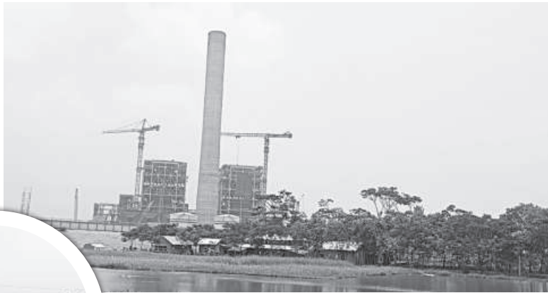
Recently visiting the power plant, this correspondent saw that local and foreign workers are doing various types of work including installation of equipment. Apart from this, internal and external road development work is also going on.

1,320MW Payra Thermal Power Plant has been operational since last year while the construction work of RPCL and Ashuganj power plants are ongoing; and the RPCL's work is almost at the end. The electricity generated here is being added to the national grid, he said. Contacted, Kalapara Upazila