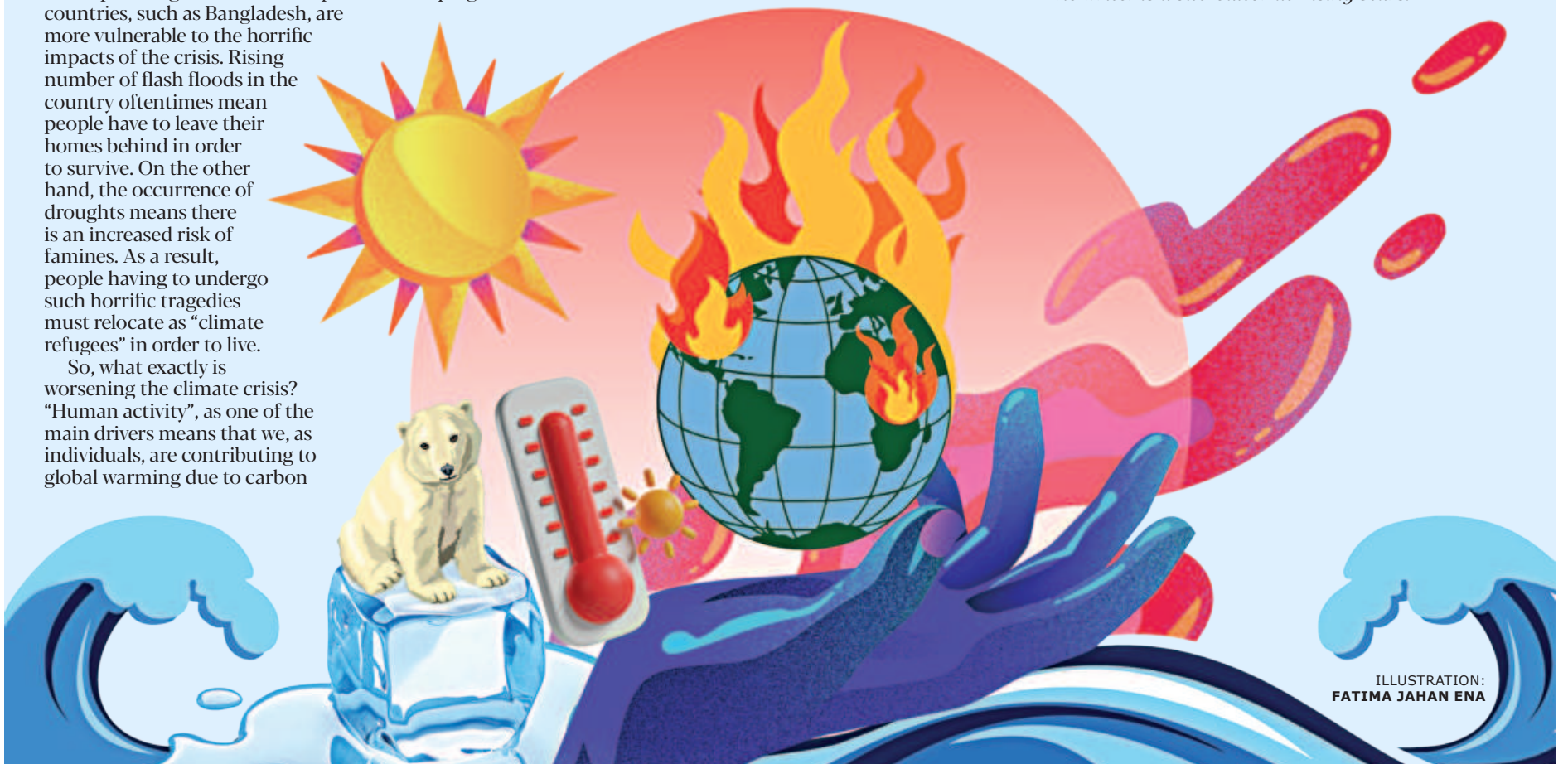
ILLUSTRATION: FATIMA JAHAN ENA

The writer is a sub-editor at Rising Stars.