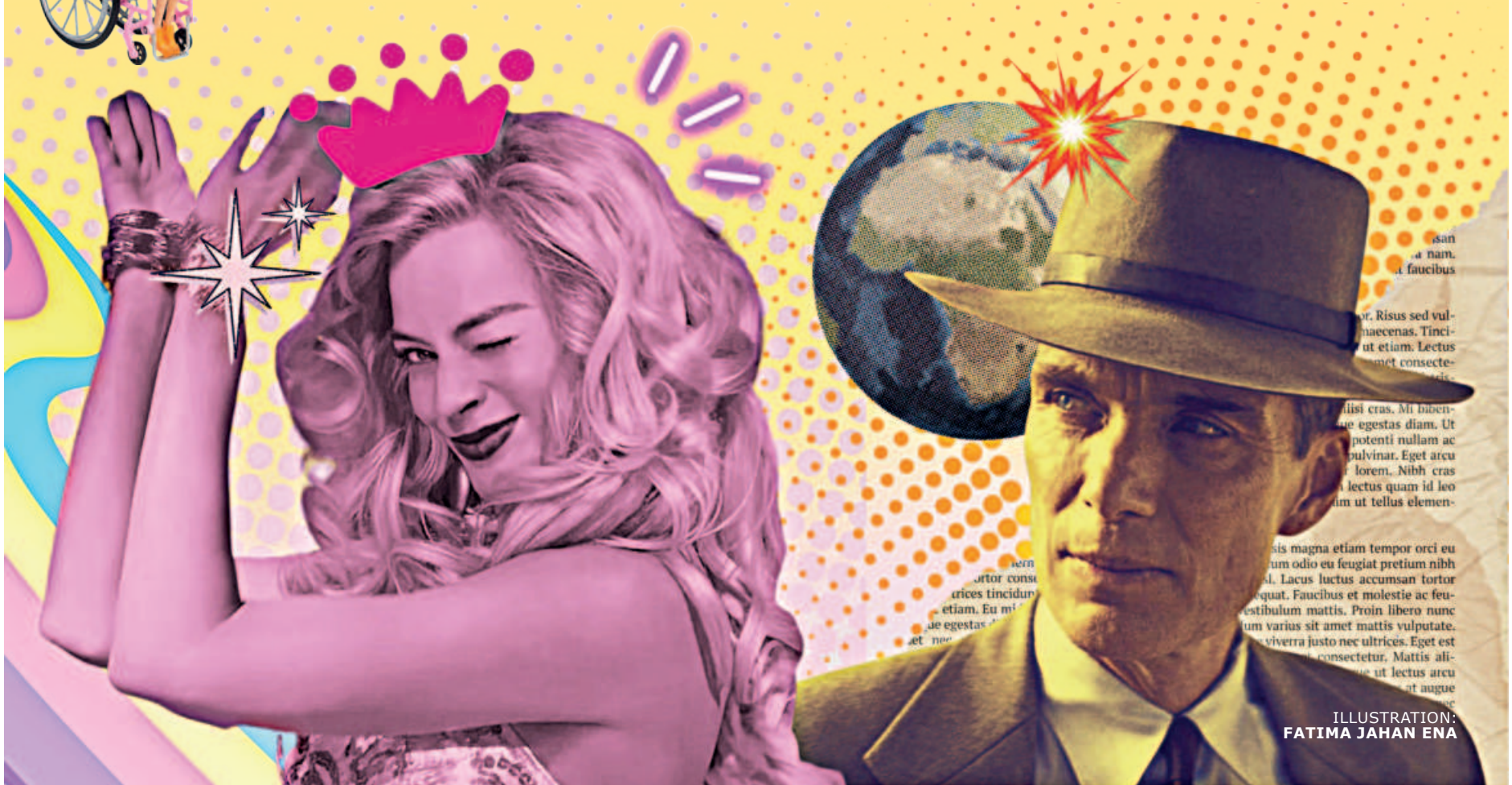
ILLUSTRATION: FATIMA JAHAN ENA

The use of subtle colour gradients and black-and-white imagery only added to the tension of the film.