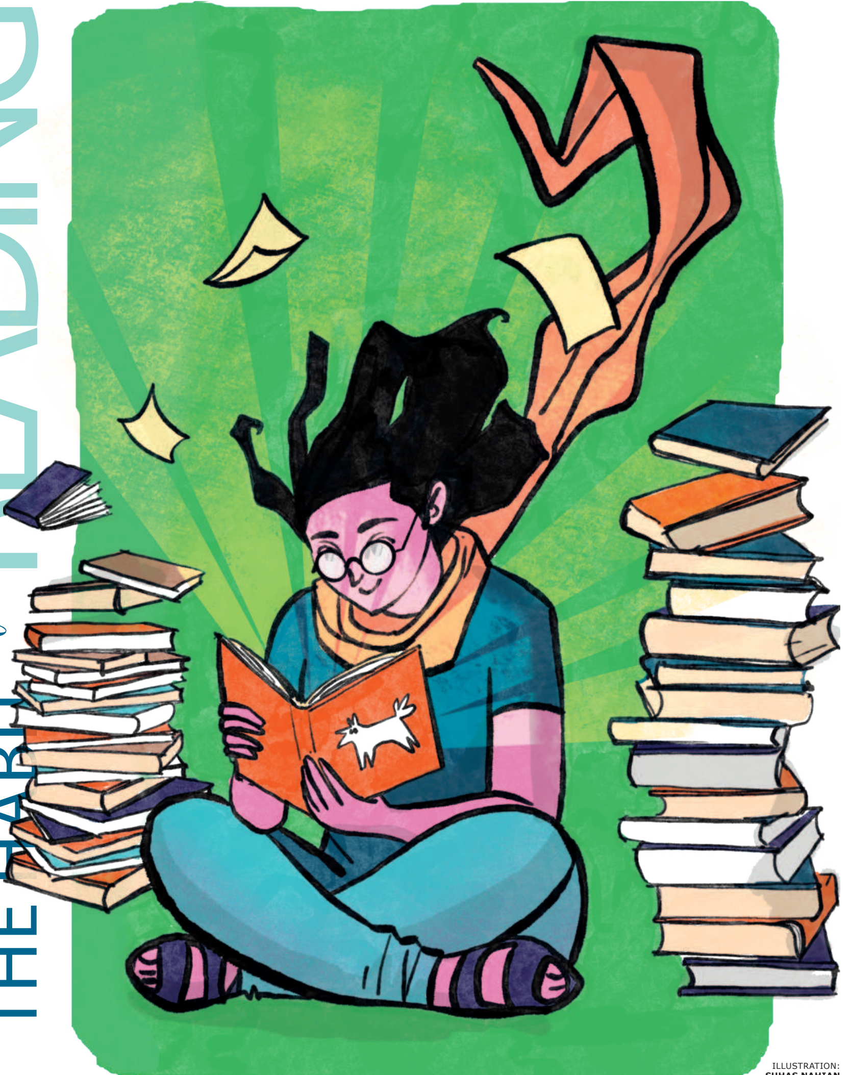
ILLUSTRATION: SUHAS NAHIAN