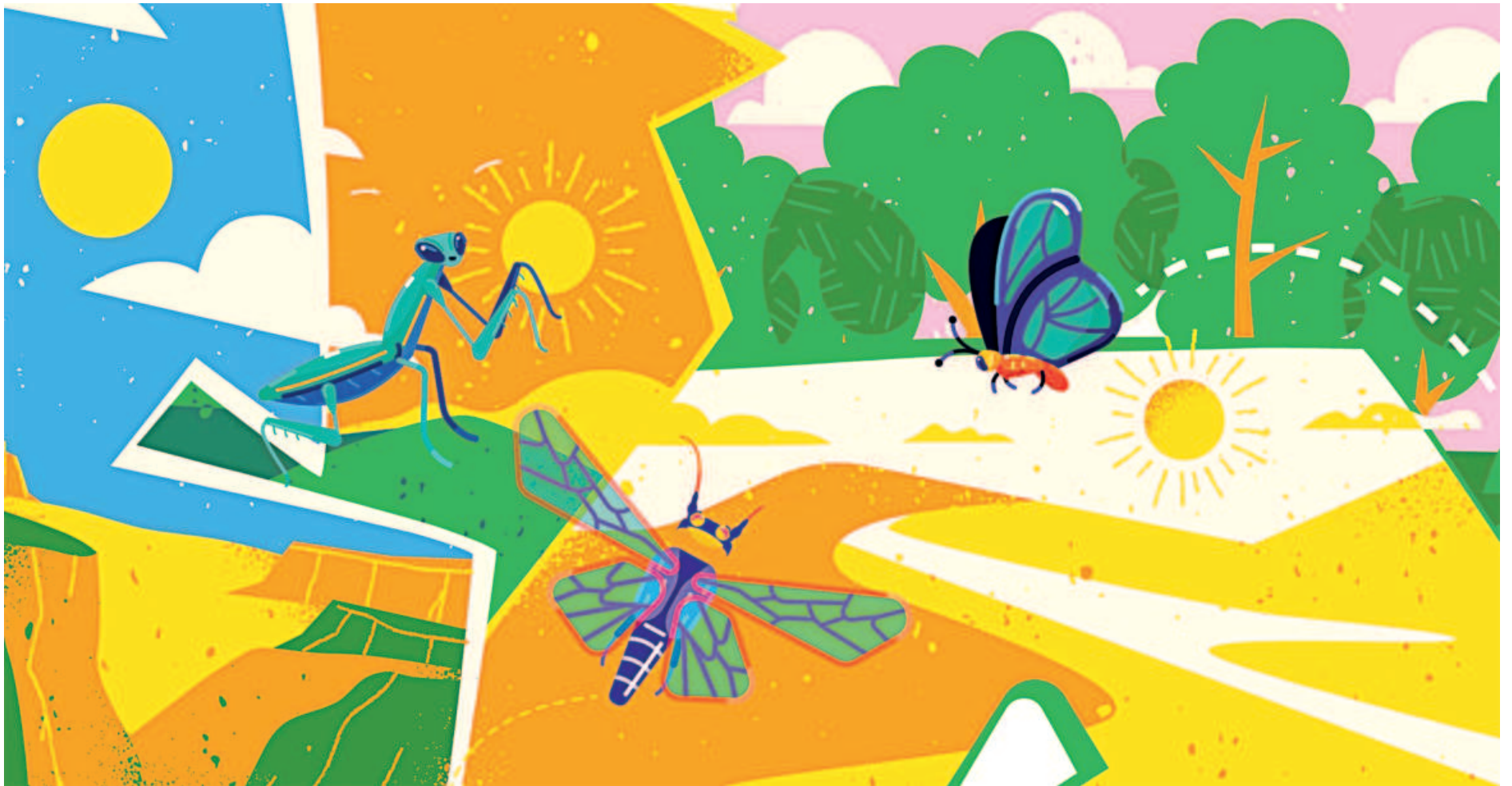
ILLUSTRATION: ABIR HOSSAIN