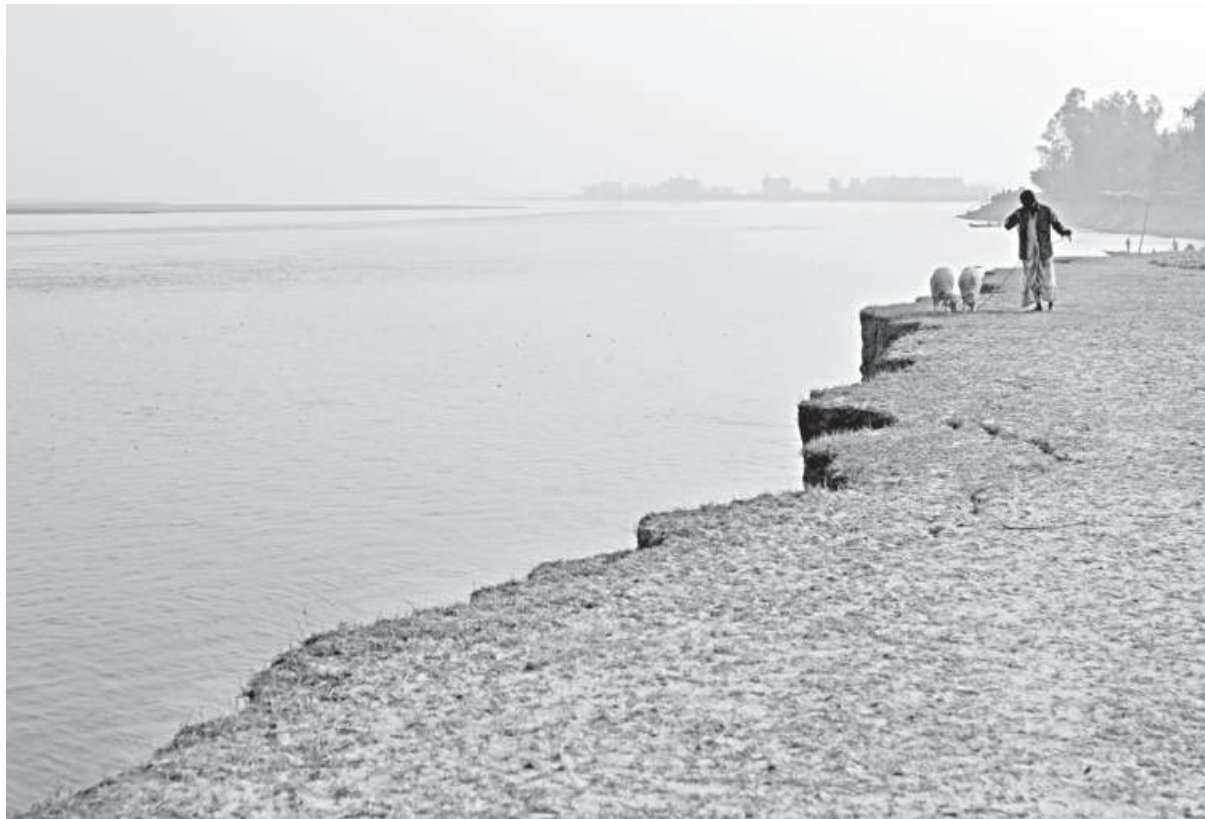
Our water development efforts lack an understanding of local cultural and indigenous practices related to flood and land use in the river delta.