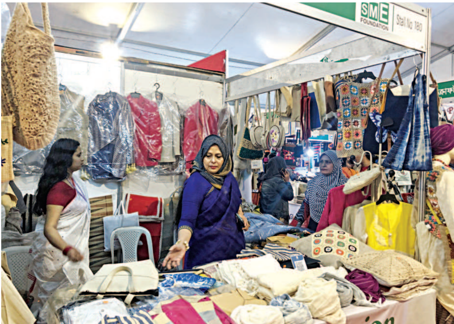
Women entrepreneurs in cottage, micro, small and medium enterprises are eligible to take loans from the Small Enterprise Refinance Scheme for Women Entrepreneurs, which was rolled out by Bangladesh Bank in 2019.

A Tk 2,137.97 crore project was approved for the construction of the "Kewatkhali Bridge Construction at Mymensingh".