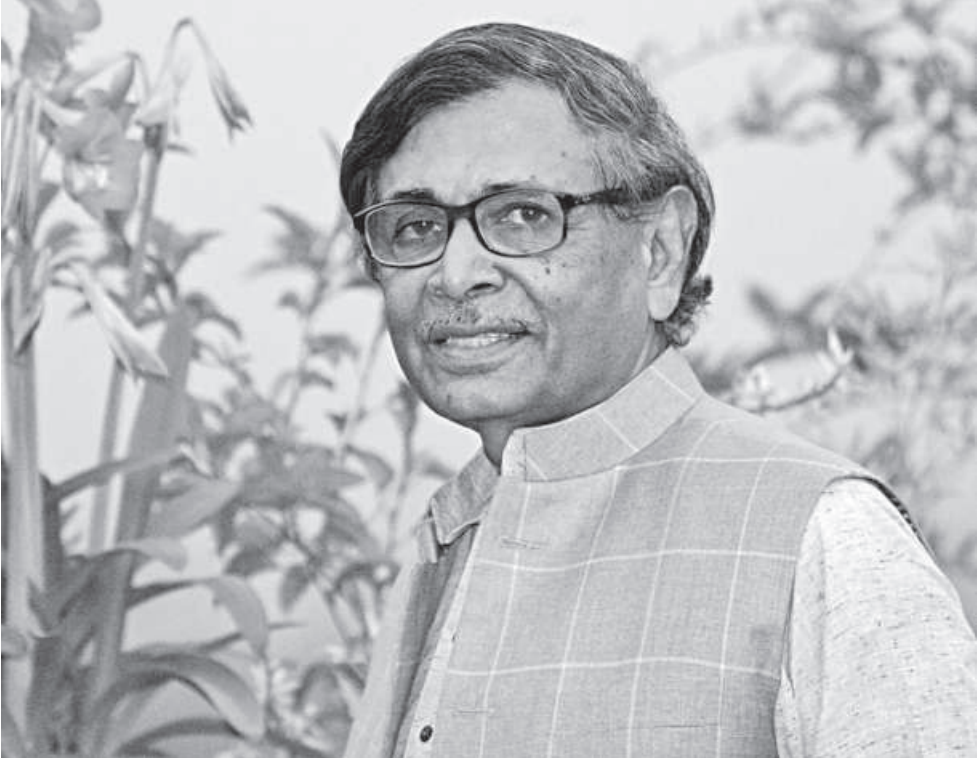
Professor Abdullah Abu Sayeed

This is how concerned Sayeed Sir is about his and BSK's reputation, which is why he has always been cautious about his work, especially