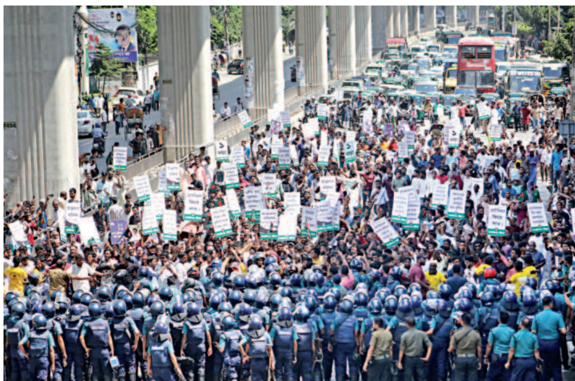
Law enforcers intercept a procession of Gono Odhikar Parishad at Bangla Motor intersection around noon yesterday when the party was heading towards the Election Commission office demanding that their party get EC registration.