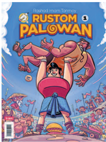
COVER ART: RASHAD IMAM TANNOY

Dhaka's comic book scene is also experiencing a remarkable surge in popularity. The colourful pages that