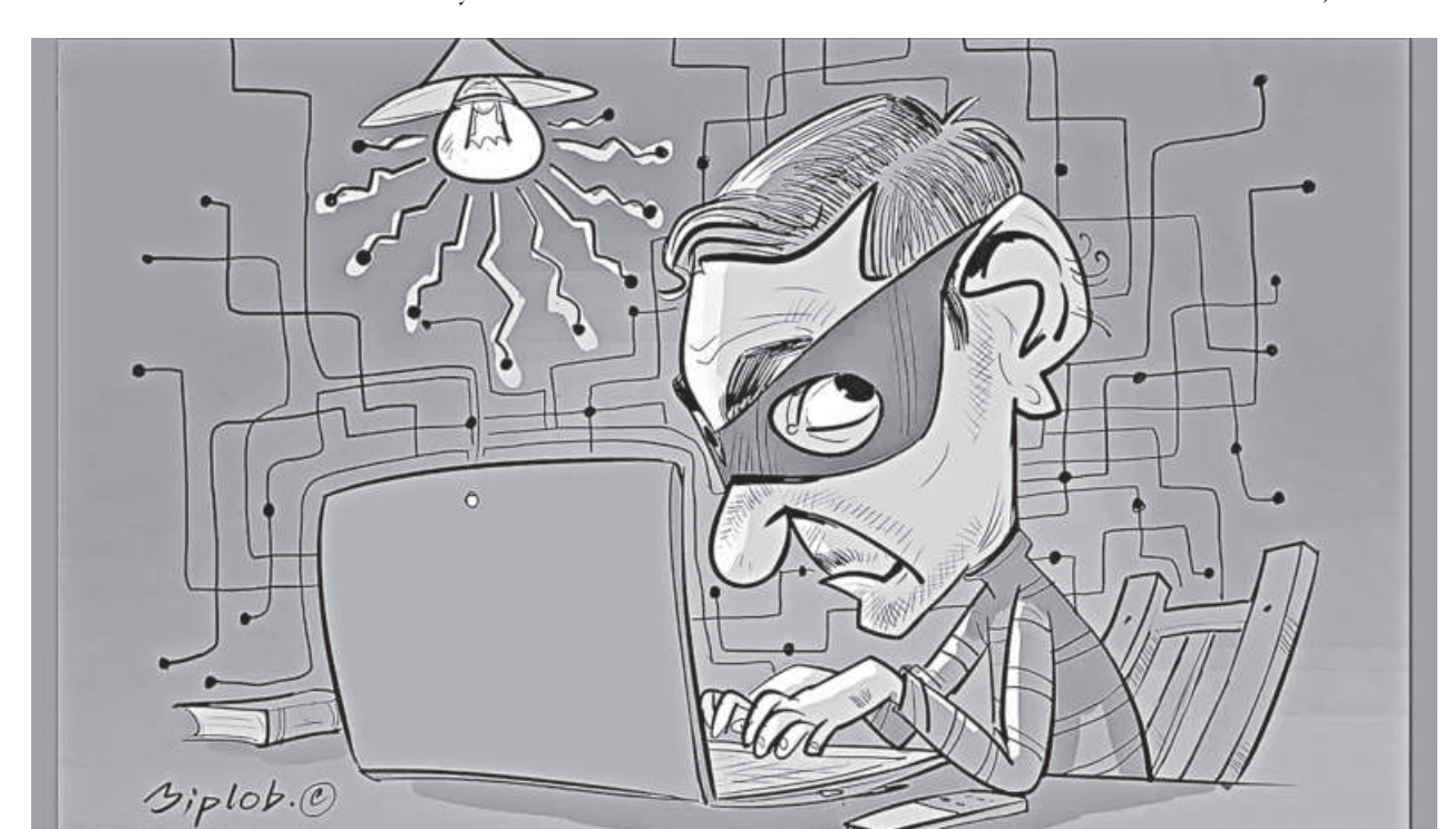
ILLUSTRATION: BIPOB CHAKROBORTY

Inadequate IT infrastructure and vulnerable digital security persist as pressing issues in the country. Recently, there have been instances of "Distributed Denial-of-Service" (DDoS) attacks, where poor security measures have allowed servers to be flooded with excessive internet traffic, resulting in the disruption of connected online services and sites. Several prominent institutions have also fallen victim to cyberattacks. The Bangladesh Krishi Bank's servers are currently