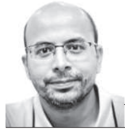
Faiz Ahmad Taiyeb is a Bangladeshi columnist and writer living in the Netherlands. Among other titles, he has authored 'Fourth Industrial Revolution and Bangladesh' and '50 Years of Bangladesh Economy.'