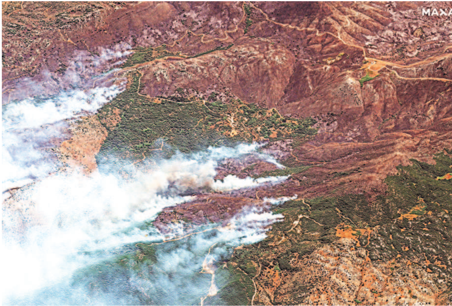
This handout satellite image taken and released by Maxar Technologies yesterday, shows smoke from a wildfire and burnt areas on the Greek Ionian island of Corfu.

The total number of casualties from the latest strikes was still unclear, the committee added.