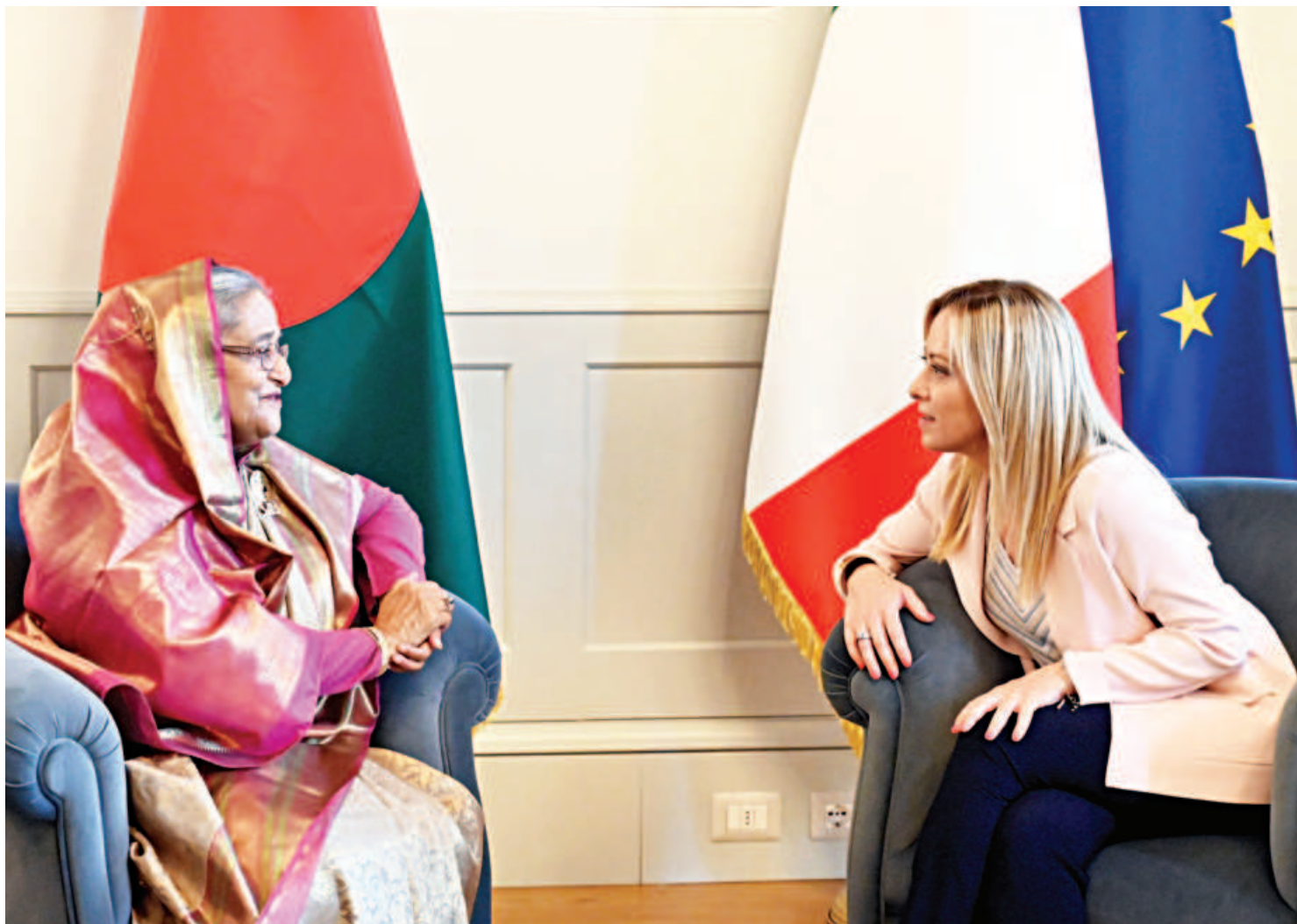
Prime Minister Sheikh Hasina at a meeting with Italian Prime Minister Giorgia Meloni at the latter's office in Rome yesterday.

The newly furnished room shows an image of Bangabandhu, depicted in a paddy field by one of Bangladesh's farmers. This artistic work was done during the "Mujib Year" - Bangabandhu's birth centenary observed in 2020-21.