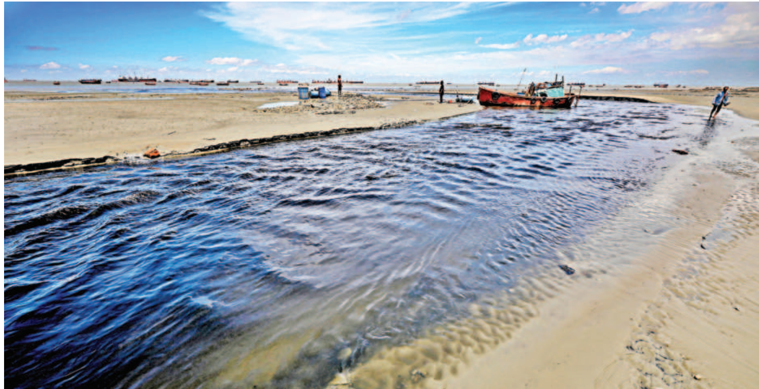
A sewer carrying waste from the port city's EPZ area empties right into the sea. With such water pollution going on unabated, the biodiversity of the Bay is slowly being destroyed. The photo was taken in Chattogram's Patenga recently.