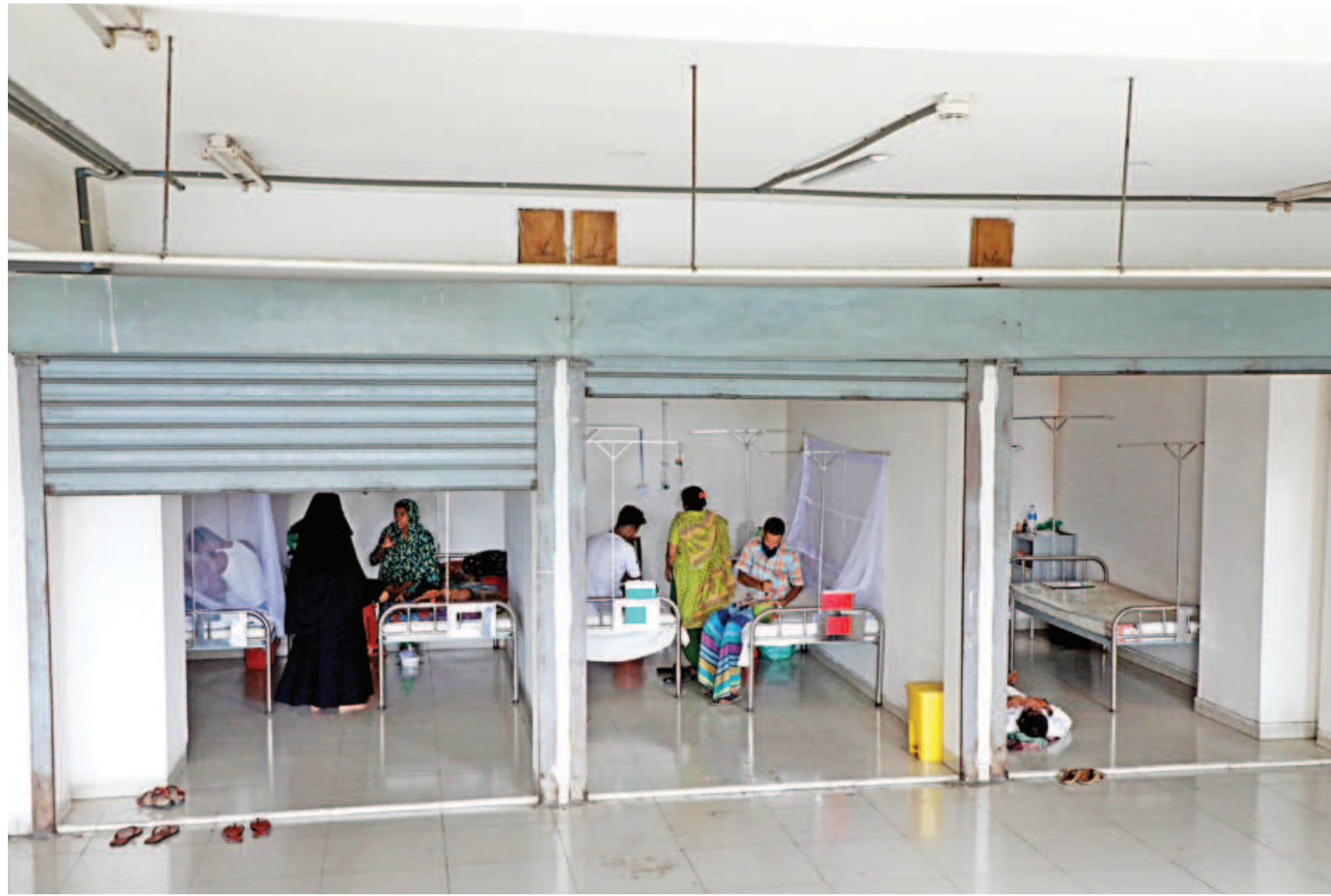
Relatives look after dengue patients at the DNCC hospital in the capital's Mohakhali. The health directorate has dedicated this hospital for the treatment of dengue patients due to the soaring caseload. Built as a market, the structure had been converted into a Covid-19 dedicated hospital. The photo was taken yesterday.