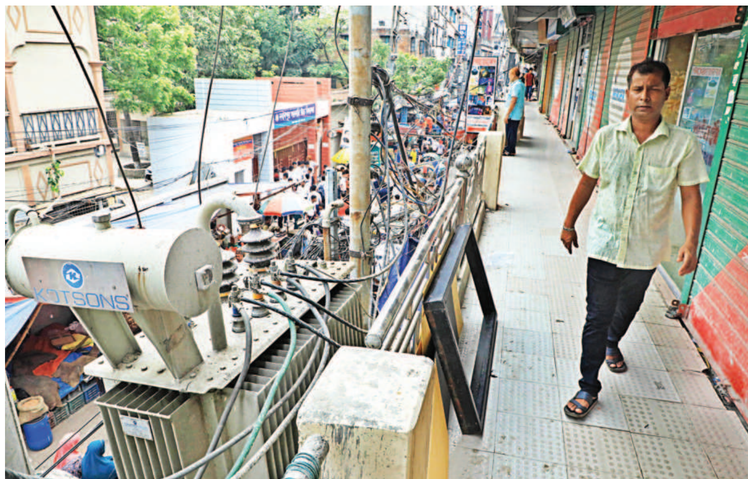
An electricity transformer has been installed right next to the Kaptan Bazar Electric Market in Old Dhaka, putting people at risk. The photo was taken recently.