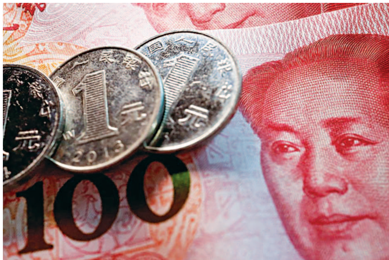
Coins and banknotes of China's yuan are seen in this illustration picture taken on February 24, 2022.