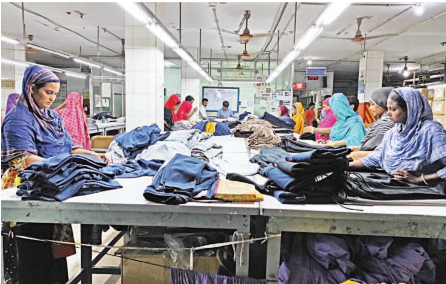
Though average production of large and medium manufacturing units grew 9.02 per cent in the July-March period of fiscal year 2022-23, it is lesser than the 16.5 per cent growth recorded in the same period of the previous year, according to the Bangladesh Bureau of Statistics. The BBS assessment utilised data from 2,040 public and private factories producing apparel, textile, food products, leather and leather goods, basic metals, chemicals and chemical products, fabricated metal products sans machinery, pharmaceuticals, and non-metallic mineral products.

The Apple Growers Association of India and Kashmir Valley Fruit Growers estimate output in Kashmir, the largest apple grower in the country, will drop 50 per cent this year from 1.87 million metric tons a year ago.