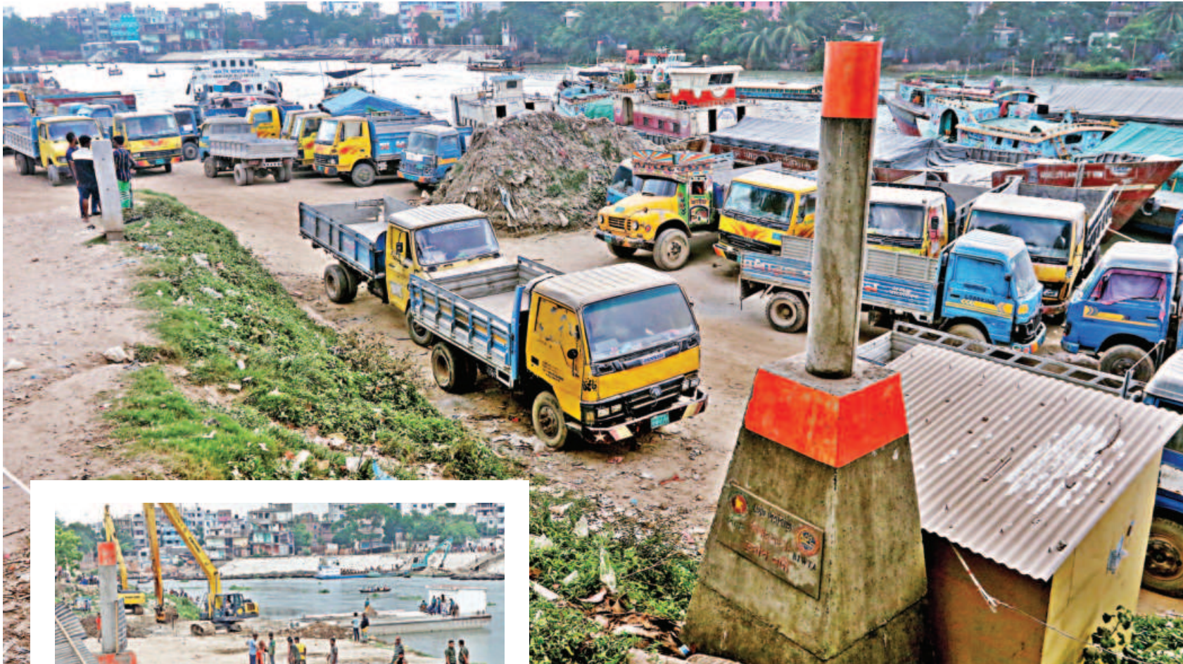
This truck stand on a land made by illegal sand-filling on the Turag in the capital's Chhoto Diya Bari Sinnirtek was removed by BIWTA. Two months have passed and things are back to square one. The photo was taken yesterday. Inset , the BIWTA drive, conducted on May 23, had also cleared 17 makeshift shops and started reclaiming the river land by excavating earth at that time.

Bangladesh got 2,858km of rail lines when it achieved independence in 1971. The length of lines, instead of increasing, came down to 2,835km in 2009.