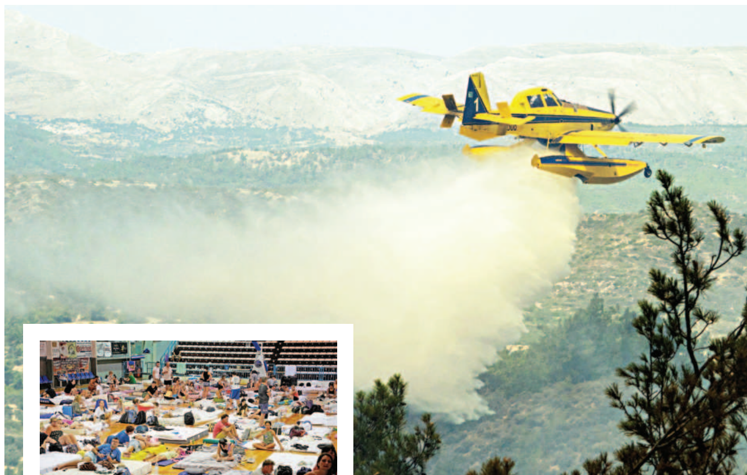
A firefighting plane drops water over a wildfire burning near Asklipto, on the island of Rhodes, Greece yesterday. Inset, Tourists are sheltered in a sports hall after being evacuated following the wildfire.

DB chief said law enforcers are on alert regarding rivalries among political factions in the city.