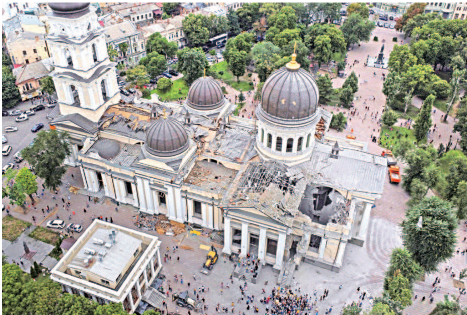
A view shows the Transfiguration Cathedral damaged by Russian missile strike, amid Russia's attack on Ukraine, in Odesa, Ukraine yesterday.

Last year's flooding killed dozens of people in Afghanistan.