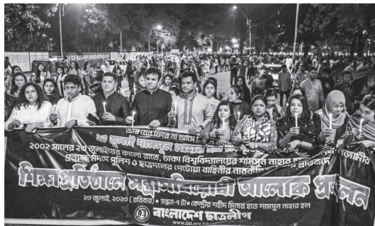
Students bring out a candle march from the Central Shaheed Minar to Dhaka University's Shamsun Nahar Hall yesterday evening to commemorate the police attack on students of the hall on July 23, 2002. Around 200 female students were injured as police charged batons on them after they protested against Jatiyatabadi Chhatra Dal leaders on the campus.