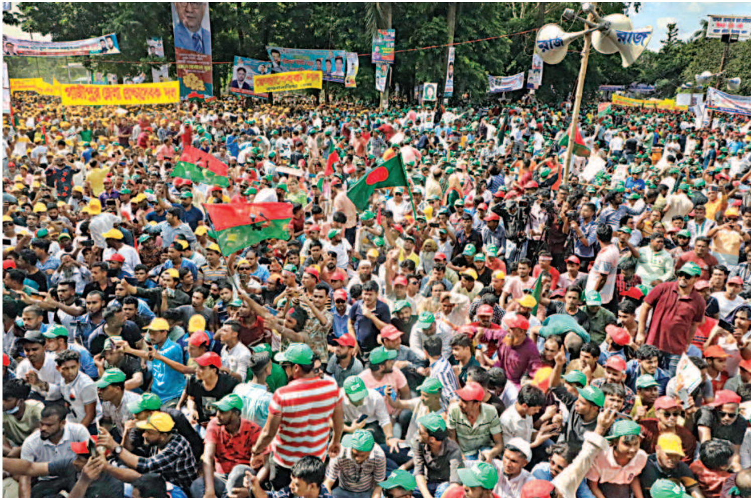
Wearing caps in vibrant red, yellow and green, hundreds of activists of BNP's associate bodies gather at the youth rally at the historic Suhrawardy Udyan yesterday. The rally was organised by Jatiyatabadi Jubo Dal, Chhatra Dal and Swechchhasebak Dal to involve youth leaders and activists in boosting the BNP's one-point movement. The photo was taken around 4:00pm yesterday.