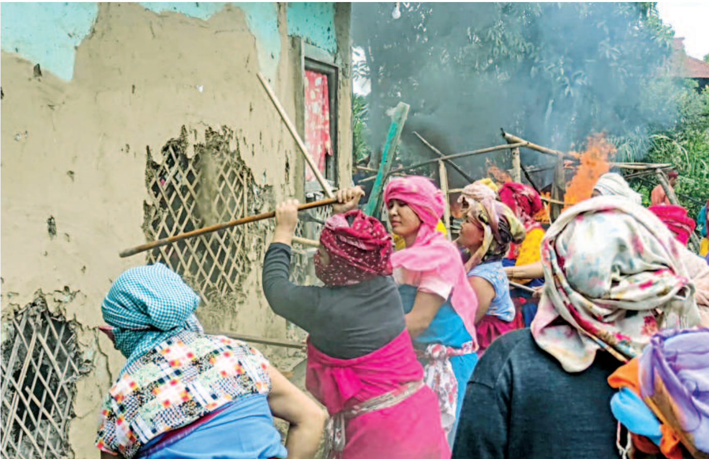
Women burn the house of one of the men accused of parading two women naked in front of a mob during ongoing ethnic violence in India's northeastern Manipur state, at Wangjing Awang Leika village of Thoubal District some 26 Km from Manipur's capital Imphal yesterday.