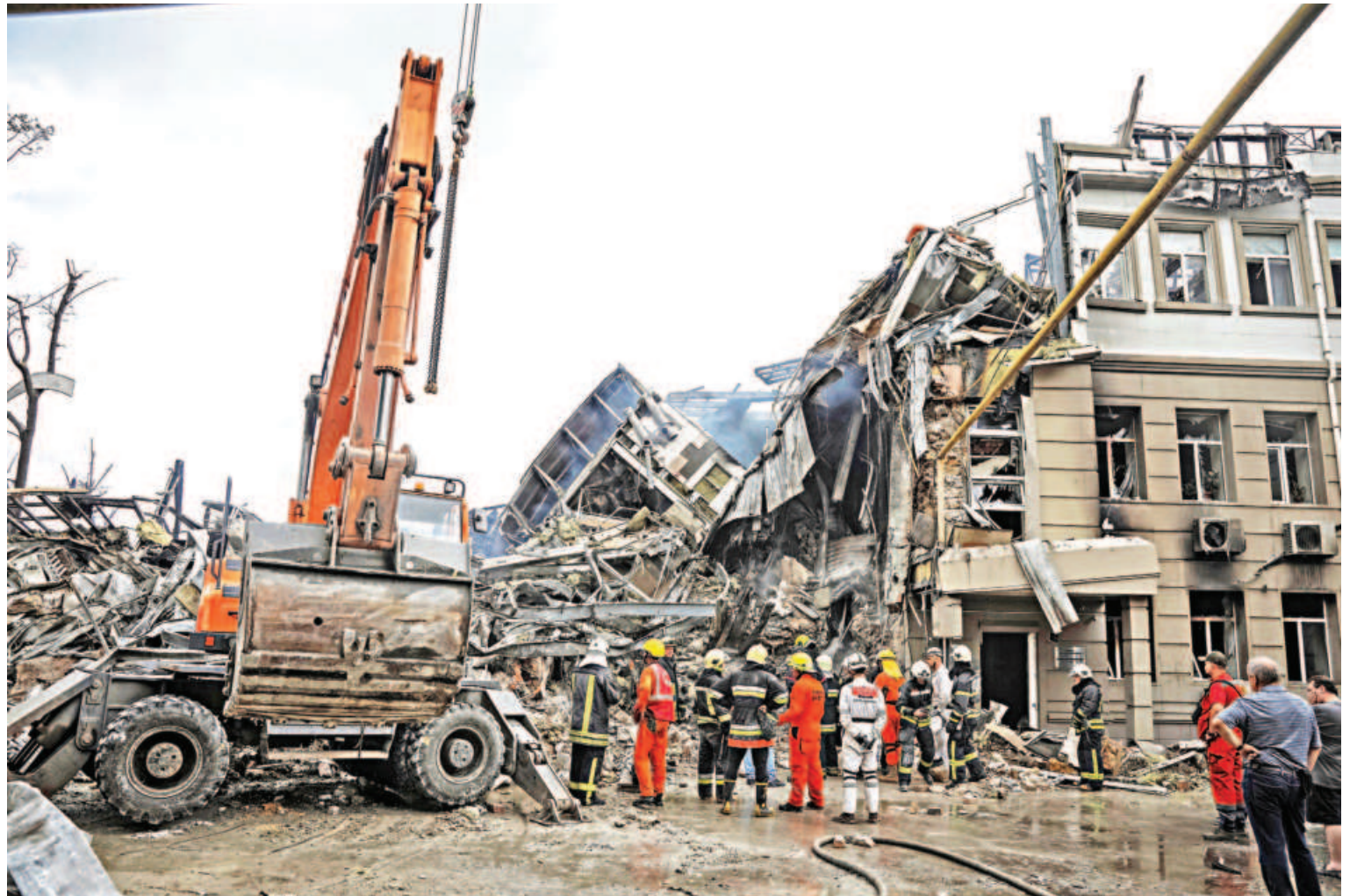
Rescuers work at a site of a building heavily damaged by a Russian missile attack, as Russia's attack on Ukraine continues, in central Odesa, Ukraine yesterday.

"The relations between our two countries will be central to the peace in the world and to the progress of our societies," the former diplomat said. Kissinger secretly flew to Beijing in 1971 on a mission to establish relations with communist China. The trip set the stage for a landmark visit by former US president Richard Nixon, who sought both to shake up the Cold War and enlist help in ending the Vietnam War. Washington's overtures to an isolated Beijing contributed to China's rise to become a manufacturing powerhouse and the world's second-largest economy.