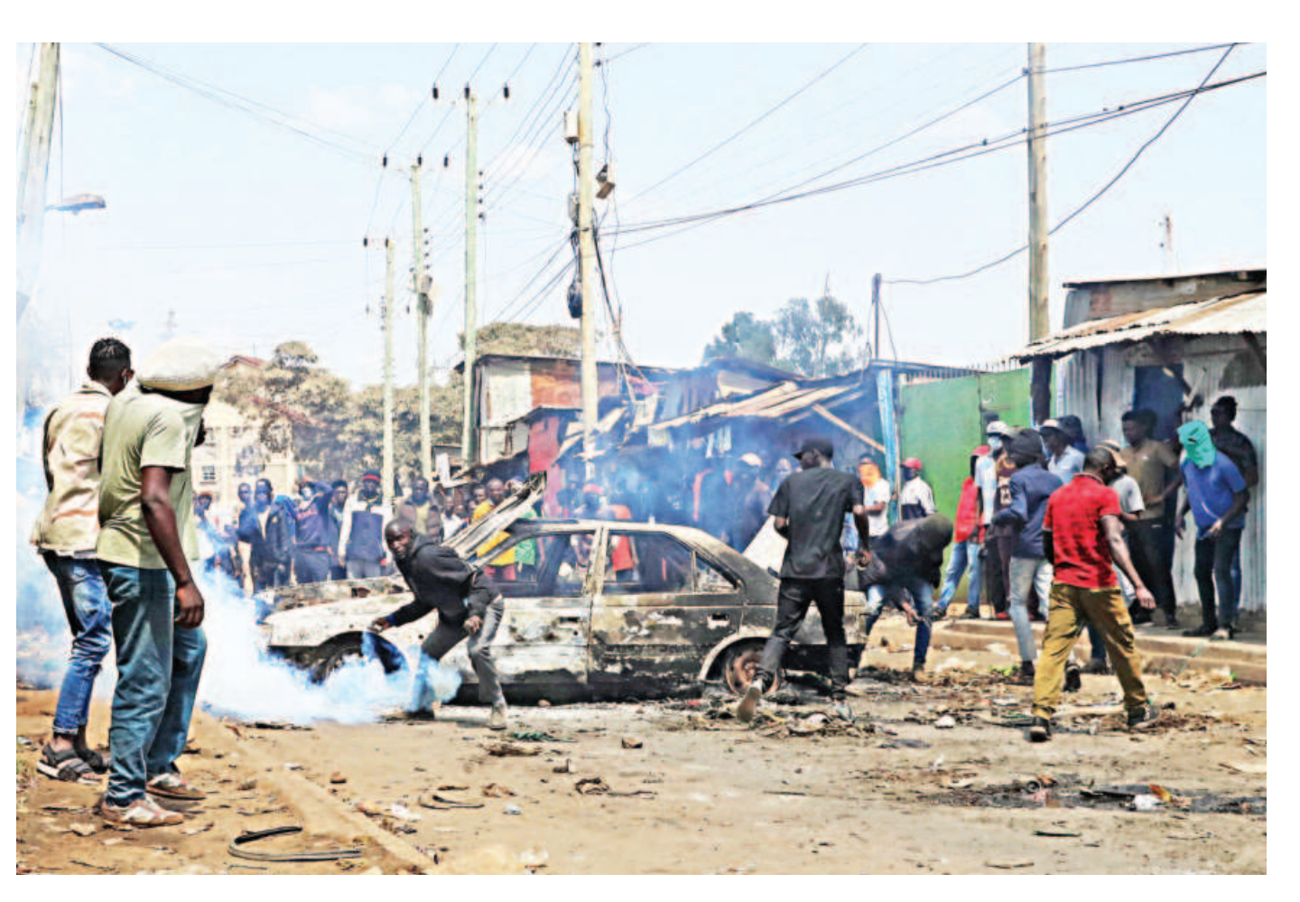
A protestor picks up a projectile as supporters of Kenya's opposition leader Raila Odinga of the Azimio La Umoja (Declaration of Unity) One Kenya Alliance, clash with police during an anti-government protest against the imposition of tax hikes by the government in Nairobi, Kenya yesterday.

Manipur Chief Minister Biren Singh tweeted that state police have made the first arrest.