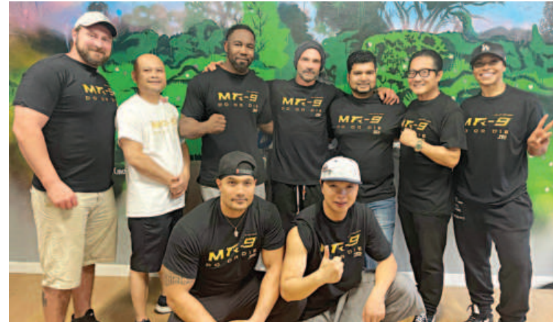
The Hollywood crew of "Mr-9: Do or Die"

Many people have compared the MR-9 film to James Bond films. When asked what made it unique from the popular franchise, the director replied that the film represented the South Asian populations.