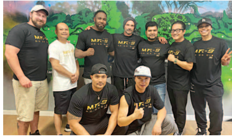
The Hollywood crew of "Mr-9: Do or Die"

"The main character is a Bangladeshi spy, which gives us an edge; we have a reality-based, unique storyline that represents people from America, China, India, and Bangladesh, among others, who come together to save the world. This story will represent unity and our minority culture," said the director.