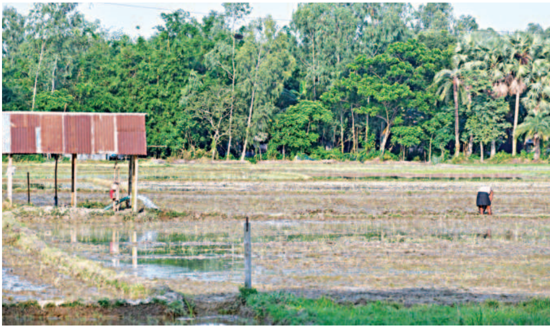
In the absence of adequate rains, a farmer is using an electricity-run irrigation system to water his fields as he prepares to cultivate Aush paddy, meaning his production cost will be higher than in the past. The photo was taken from Bogura's Nandigram upazila on Wednesday.

Extreme weather events are already affecting the agriculture sector of Bangladesh.