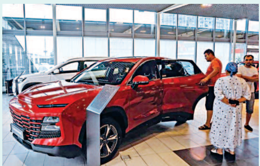
People inspect a Jetour Dashing crossover produced by Chinese automaker Jetour at the Keyauto dealership in Lyubertsy, Moscow on July 12.

"Production localisation is gradually increasing," Moskvich told Reuters,