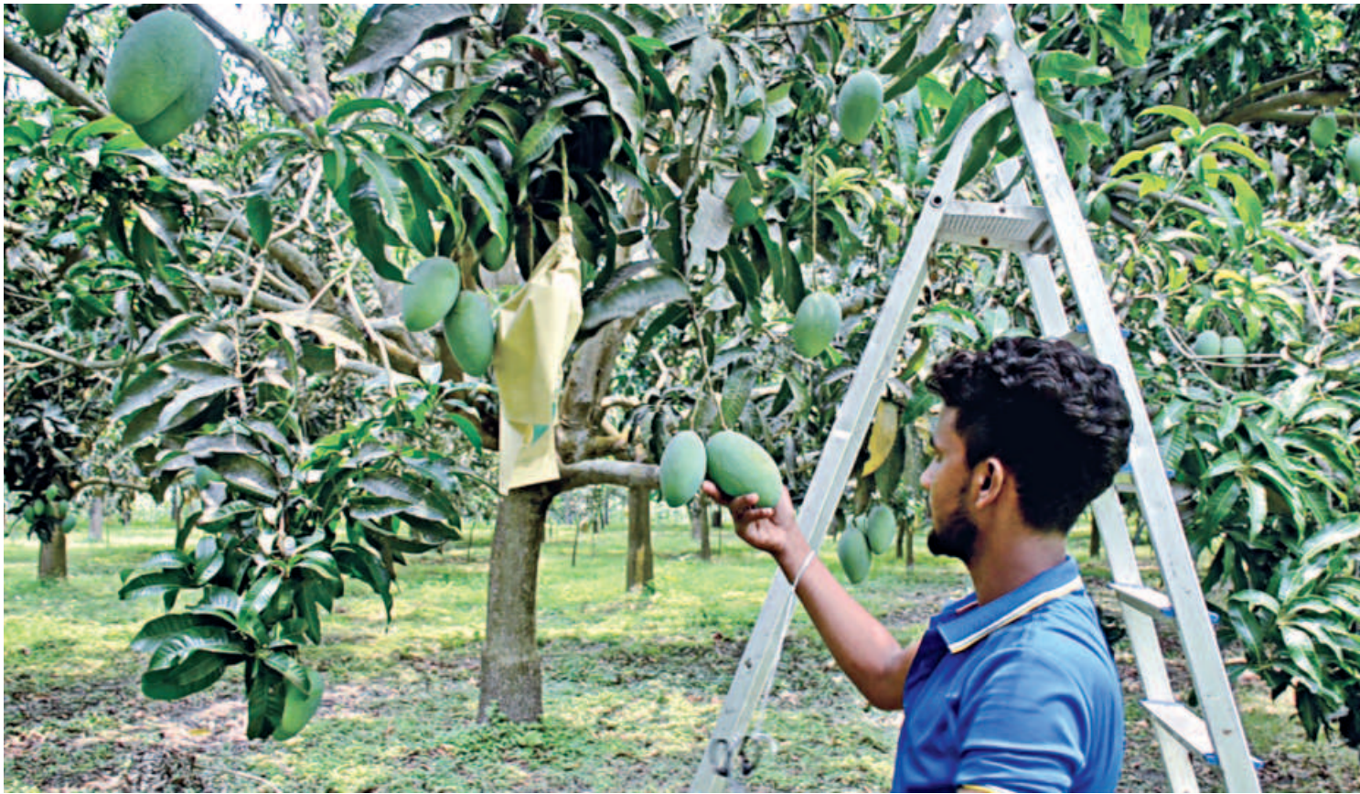
Some 23.5 lakh tonnes of mango were produced in Bangladesh in fiscal year 2021-22, according to data from the Department of Agricultural Extension.

The BB in its guideline said investors willing to set up a digital bank will have to have a minimum paid-up capital of Tk 125 crore and the capital will have to come from the sponsors.