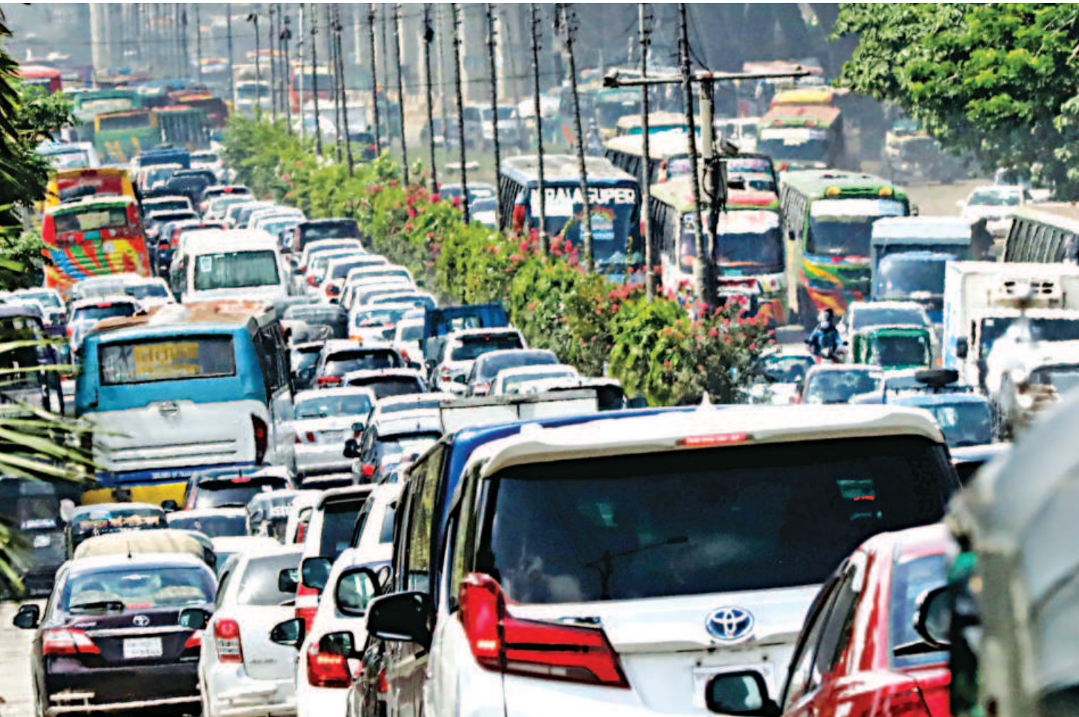
Commuters on Airport Road had to face long tailbacks throughout yesterday. Even though such a situation has become a norm in the area, the by-polls to Dhaka-17 exacerbated people's sufferings.