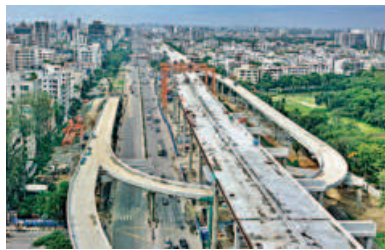
DHAKA ELEVATED EXPRESSWAY (PARTIAL)

Govt to open 7 projects in Sept-Oct; AL to showcase them in campaign for general elections; expert urges building capacity for operations