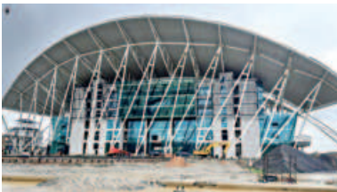
CHATTOGRAM-COX'S BAZAR RAIL LINE

Possible opening in October TOTAL COST: Tk 21,399 crore DURATION: July 2016-June 2025