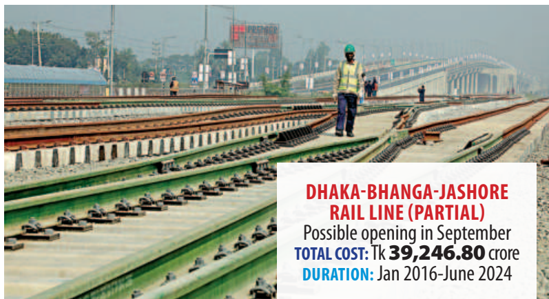
DHAKA-BHANGA-JASHORE RAIL LINE (PARTIAL)

Possible opening in September TOTAL COST: Tk 10,690 crore DURATION: Nov 2015-Dec 2023