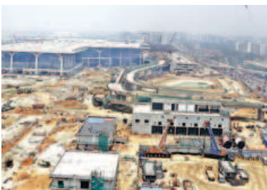
DHAKA AIRPORT'S THIRD TERMINAL (PARTIAL)

Possible opening in September TOTAL COST: Tk 39,246.80 crore DURATION: Jan 2016-June 2024