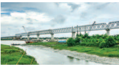
KHULNA-MONGLA RAIL LINE

Possible opening in late September or early October TOTAL COST: Tk 18,034.48 crore DURATION: July 2010-Jun 2024