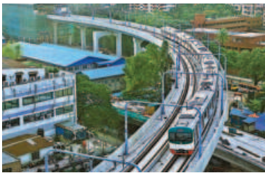
METRO RAIL (MRT-6 SECOND PHASE)

Possible opening in September TOTAL COST: Tk 13,857.57 crore DURATION: July 2011-June 2024