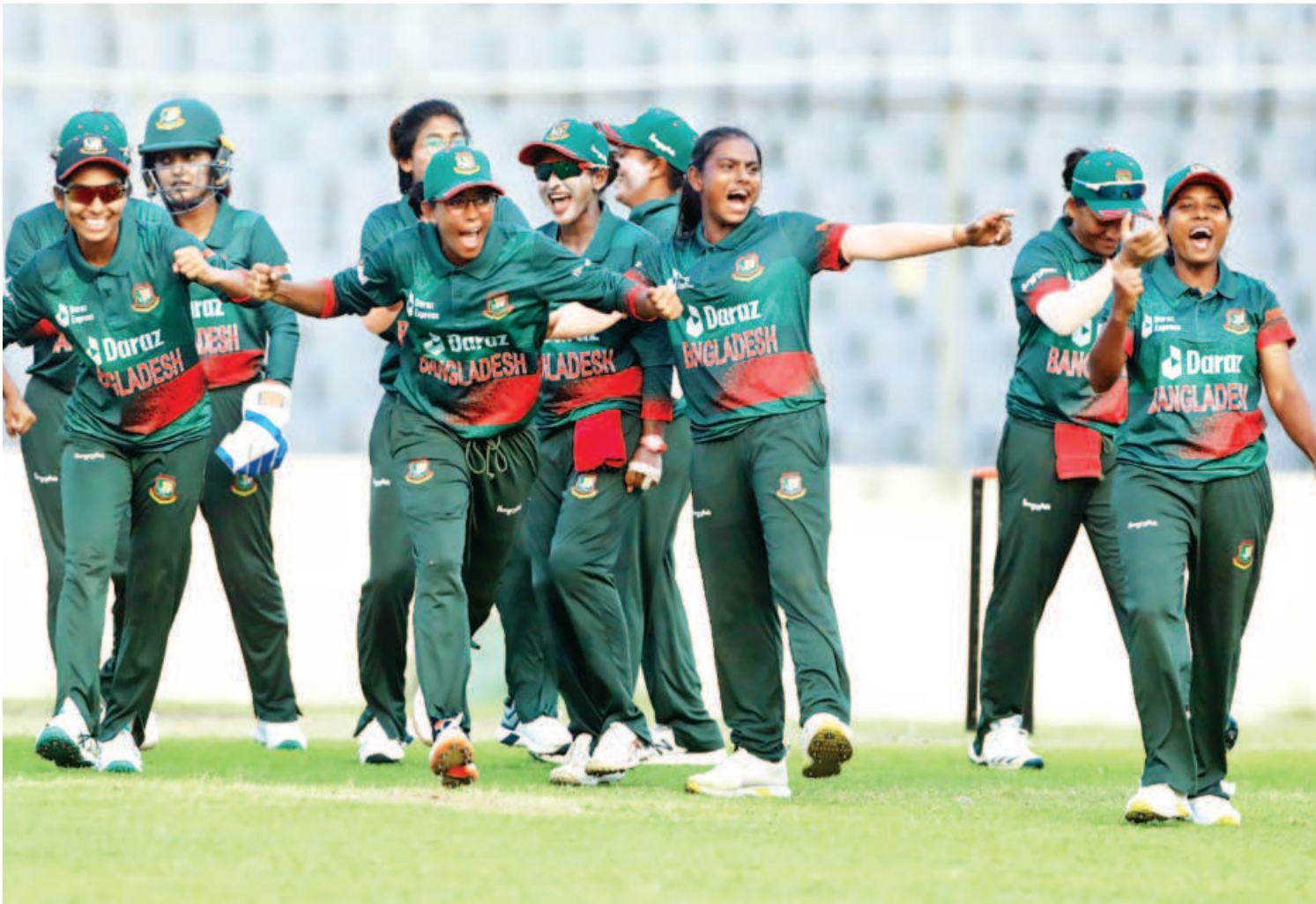
Bangladesh players celebrate their historic maiden ODI victory over India in the first match of the three-match series at the Sher-e-Bangla National Stadium in Mirpur yesterday. Story on page 11.