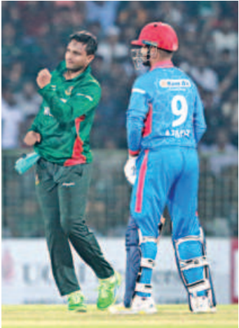
to contend with the extra bounce. While Mustafizur Rahman gave away 13 runs in the last over of the Powerplay, this time the supporting acts of Shakib and Nasum Ahmed were on point. Both bowlers put in economical overs before rain stopped play for over an hour. After the rain, Shakib brought