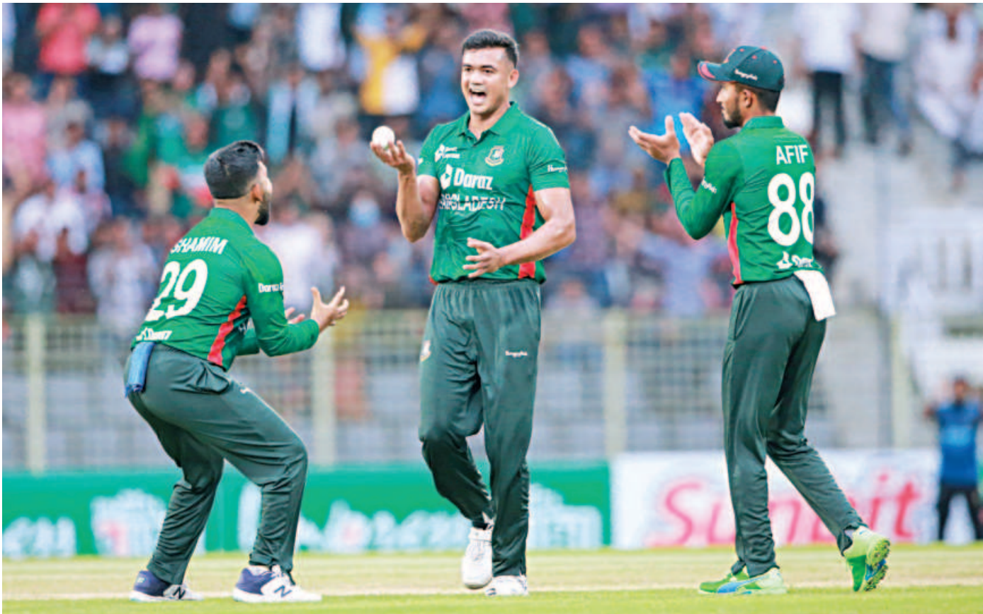
Bangladesh's strike bowler Taskin Ahmed takes a catch off his own bowling to remove Afghanistan opener Rahmanullah Gurbaz, taken aback by a short delivery, in the very first over of the second T20I in Sylhet yesterday. Taskin also removed the other Afghan opener, Hazratullah Zazai, with yet another short of a length delivery to give the Tigers a flying start, which was capitalised later on by [bottom] skipper Shakib Al Hasan as he accounted for two more Afghan batters to put pressure on the visitors.

REUTERS Argentina great Lionel Messi has completed his signing for Inter Miami on a deal that will keep him in Florida until 2025, the Major League Soccer side said on Saturday. The seven-time Ballon d'Or winner will be joining the squad in the coming days and will hold a franchise player spot, the club added. The 36-year-old himself said: "This is a great opportunity and together we will continue to build this beautiful project," said Messi. "The idea is to work together to achieve the goals we set ourselves and I'm really looking forward to being able to start helping here in my new home." Messi is expected to make his debut next Saturday when Miami host Mexico's Cruz Azul in their Leagues Cup opener. Team co-owner David Beckham said: "I dreamed of bringing the best players in the world, players with the same ambition I had when I came to the LA Galaxy to help grow football in the United States and build a legacy in this sport we love so much. "Today that dream has become a reality. I couldn't be prouder that a player of Leo's caliber is coming to our club." Having the World Cup winner on board promises to be a big boost for soccer in the U.S. where the sport trails in popularity behind the other major North American men's professional leagues. Messi will be formally unveiled on Sunday in an entertainment event at DRV PNK Stadium.