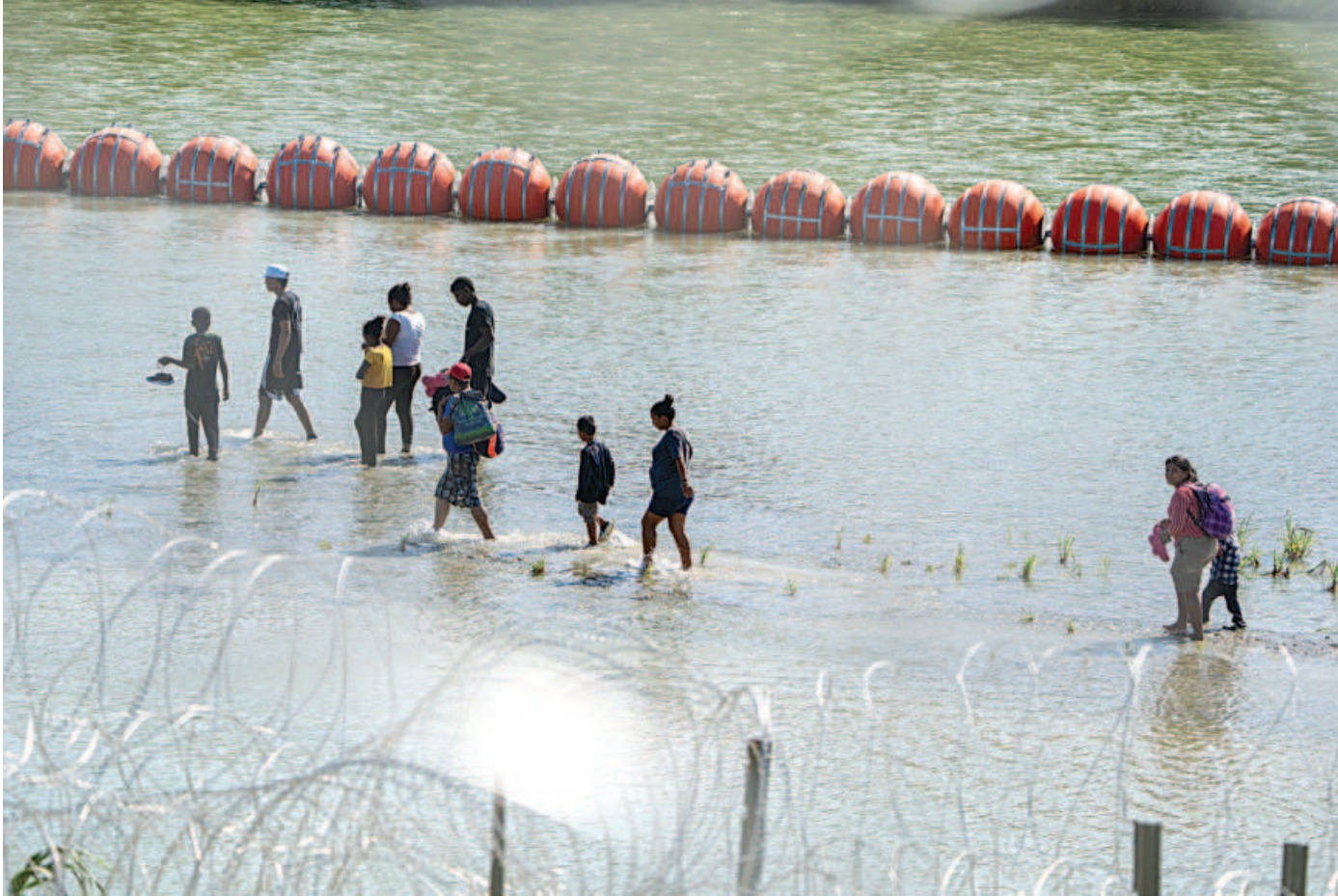
Migrants walk by a string of buoys placed on the water along the Rio Grande border with Mexico in Eagle Pass, Texas, US on Saturday, to prevent illegal immigration entry to the US. The buoy installation is part of an operation Texas is pursuing to secure its borders, but activists and some legislators say Governor Greg Abbott is exceeding his authority.