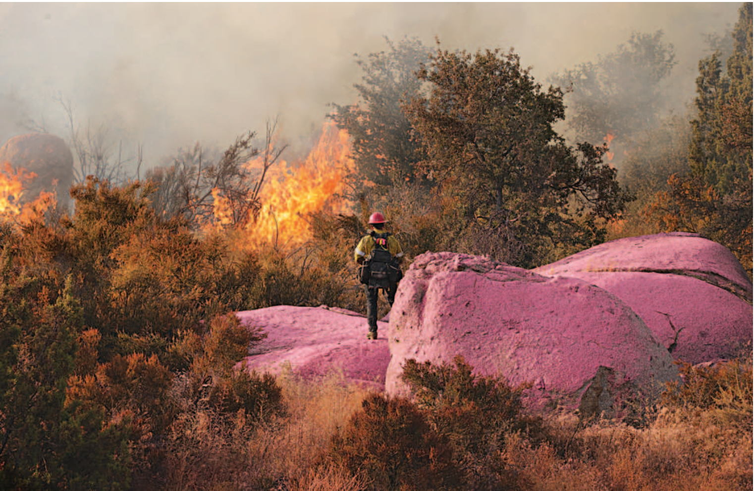
A firefighter stands on boulders covered with pink fire retardant while monitoring the Gavilan Fire, which has already burned more than 250 acres in Perris, Riverside County, California, US on Saturday. Brutally high temperatures threaten tens of millions of Americans, as numerous cities braced to break records under a relentless heat dome that has baked parts of the country all week.

morning after floodwaters swept in too quickly for the vehicles inside to escape, according to the Yonhap. Five people were rescued from a bus in the tunnel Saturday, and nine bodies have so far been pulled from the site, with divers working around the clock searching for more victims, the interior ministry said. The police have received missing person reports for 11 people believed to be in the tunnel, but a final official toll has not yet been provided, as it is unclear how many people were in each car, Yonhap reported. "I have no hope but I can't leave," a parent of one of those missing in the tunnel told Yonhap. "My heart wrenches thinking how painful it must have been for my son in the cold water." Images broadcast on local television showed a torrential stream of water from a nearby river that had burst its banks flooding into the tunnel, as rescue workers struggled to use boats to get to people inside. South Korean President Yoon Suk Yeol held an emergency meeting with his aides on the government's response, his office said.