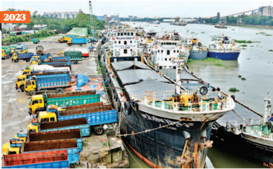
Left, ships are moored at a jetty on the Shitalakkhya in Kanchpur of Narayanganj. The authorities set up the jetty for loading and unloading of factory products and raw materials. With this initiative, the authorities have protected the river bank from grabbers. Encroachment was evident in the photo, right, published in The Daily Star on November 7, 2012.