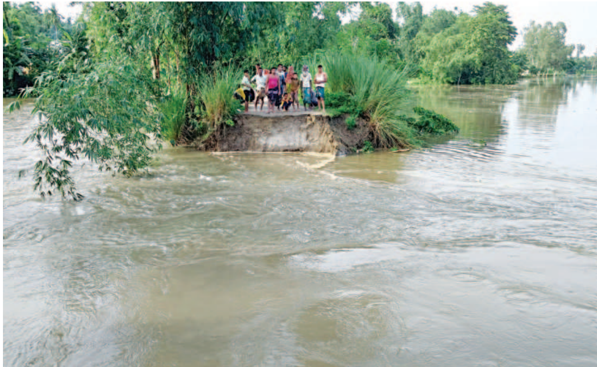
The Dharla has washed away a section of a road in Gorokmandal BDR Bazar area of Kurigram's Phulbari upazila, cutting road communications between six villages and the upazila town. Parts of five upazilas in the district have already been affected by flooding due to onrush of water from upstream and heavy rain. The photo was taken yesterday afternoon.