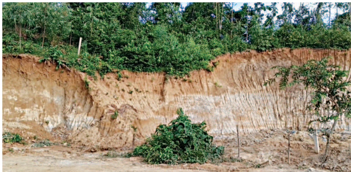
A part of this hill, covering approximately 10 acres, has been razed by a vested quarter, defying environmental regulations.