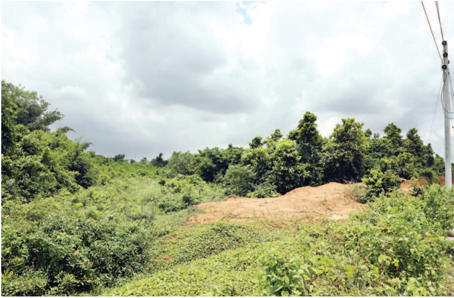
An urban forest will be created in Purbachal Residential Area of the capital, under the initiative of the Forest Department and Rajuk. Such forests serve as vital defenses against airborne pollutants, alleviate the heat island effect, improve mental well-being, and contribute to the replenishment of water tables.