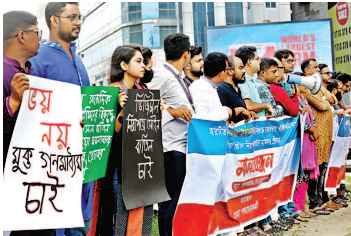
Demanding repeal of the Digital Security Act, journalists form a human chain at the capital's Karwan Bazar roundabout yesterday.