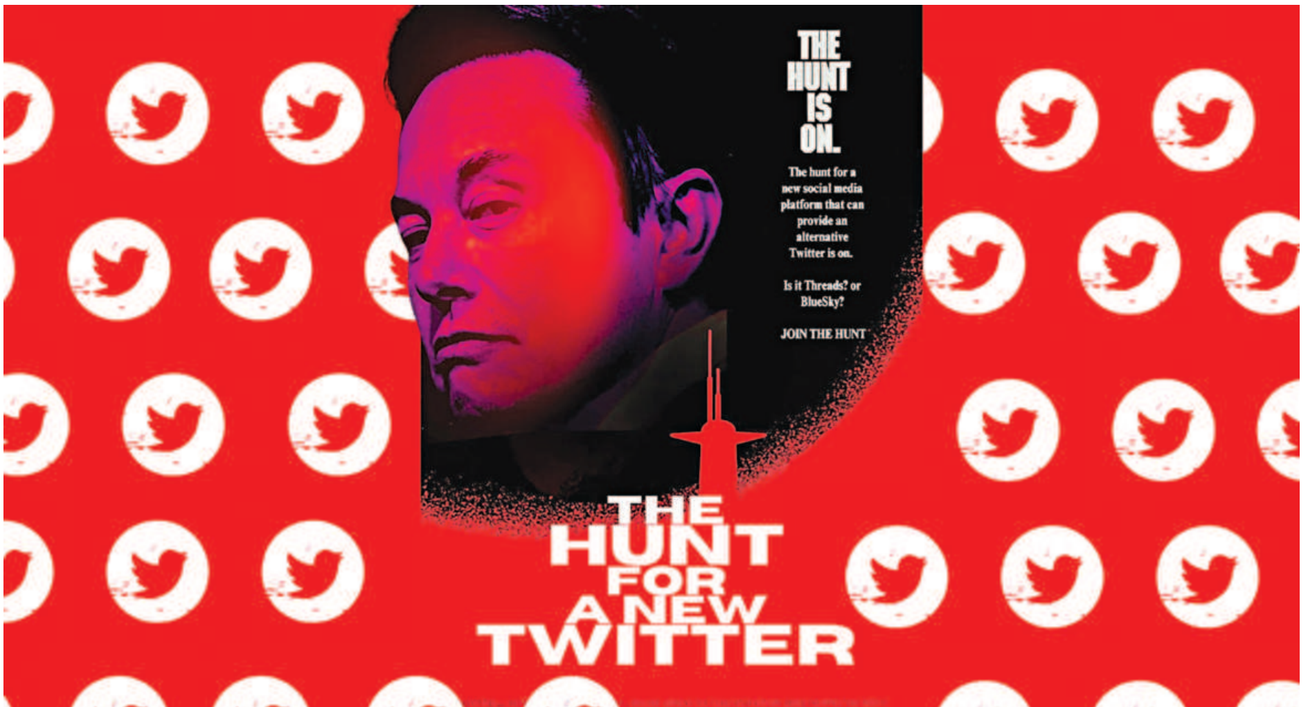
ILLUSTRATION: ZARIF FAIAZ