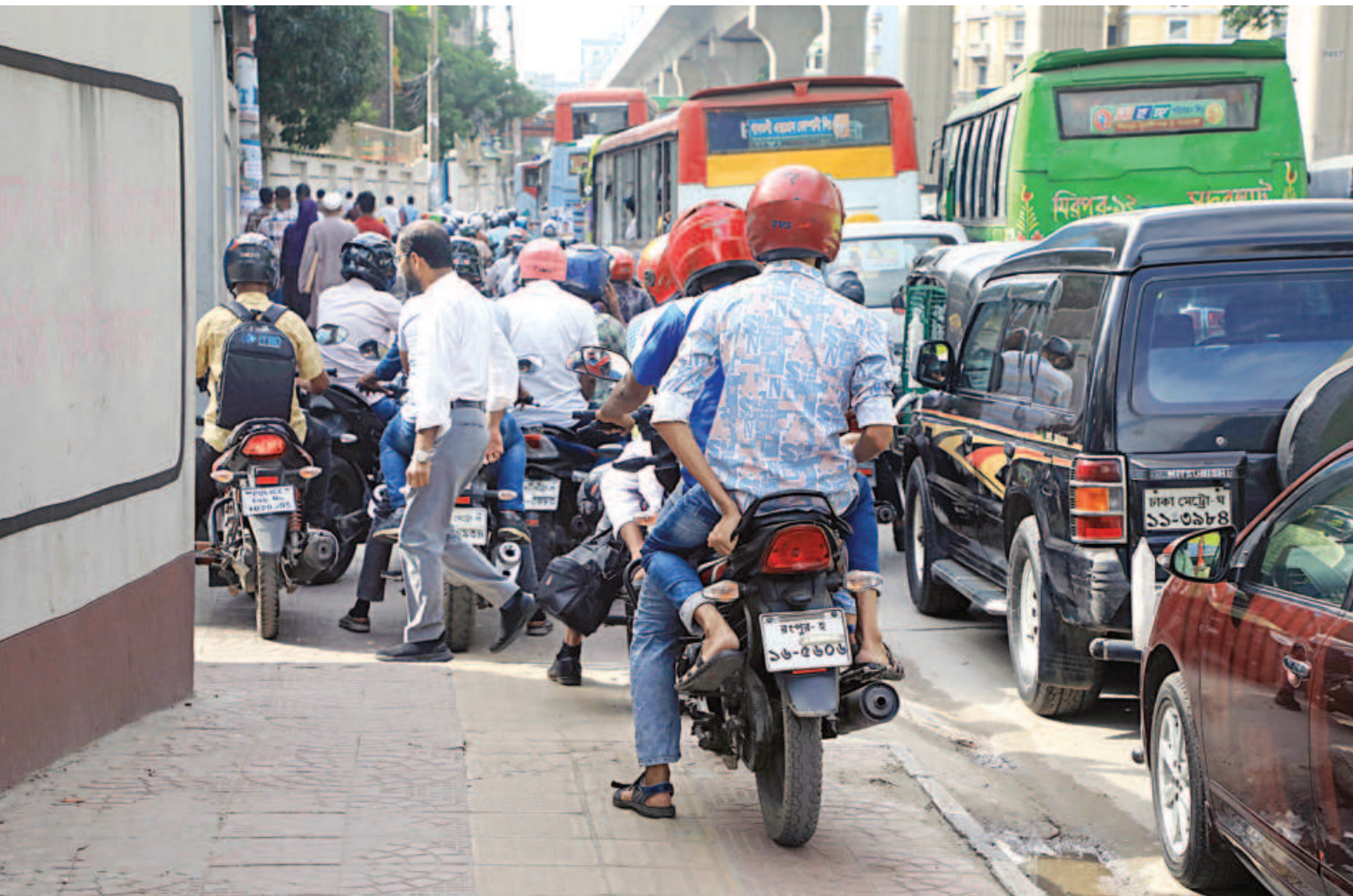
A pedestrian struggles to find his way ahead among illegally-queued bikes on a footpath near the capital's Banglamotor intersection yesterday. This scenario is common in the area as the authorities seldom take measures to address the issue.