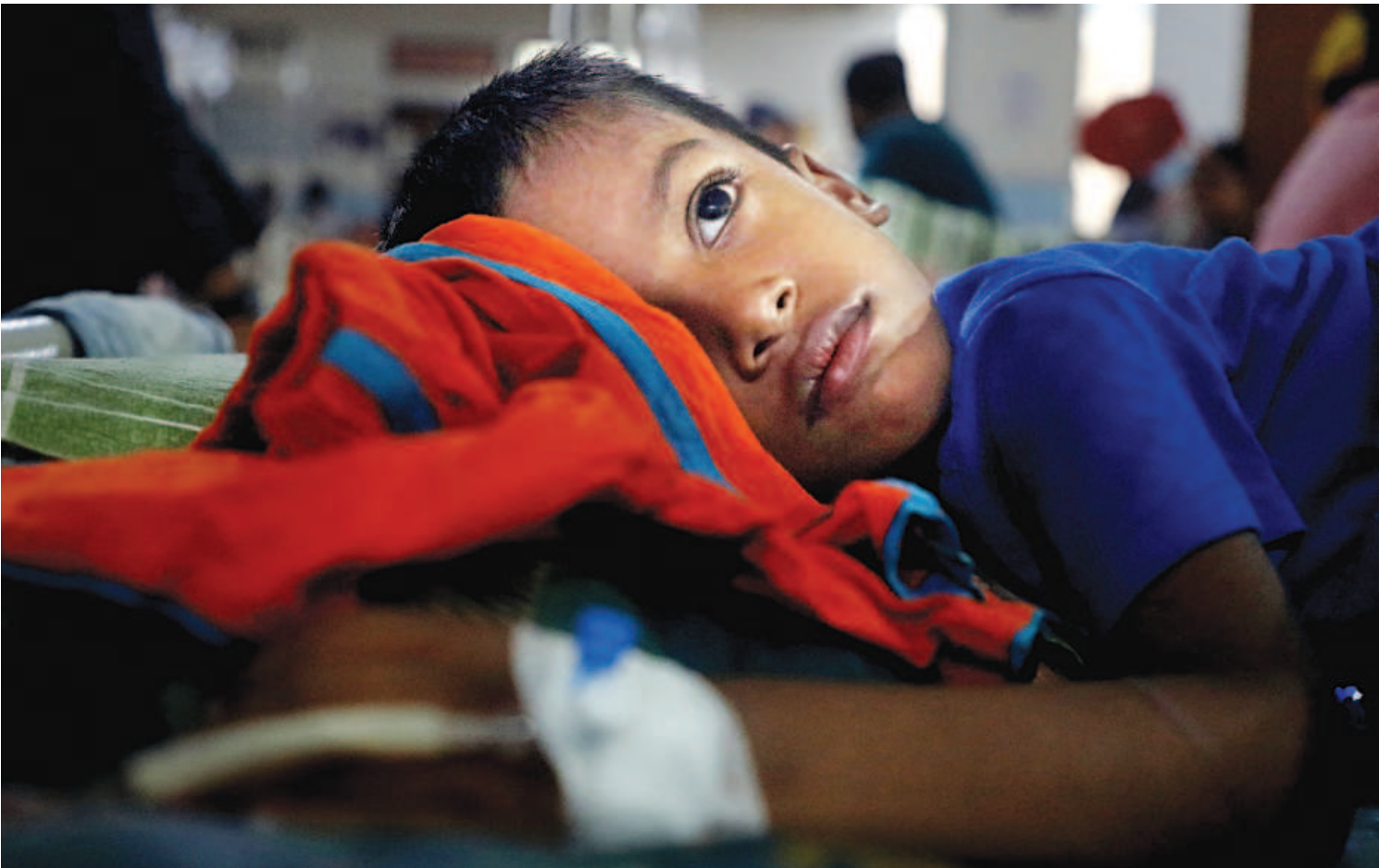
A boy fights dengue at Mugda Medical College and Hospital, his hopeful eyes showing his strength. The cannula attached to his hand is a stark reminder of the severity of the situation, but it does not deter him. In a grim trend over the last few days, the number of child dengue patients has shot up in hospitals across the capital. With 1,239 more patients hospitalised with dengue during the 24 hours till yesterday morning, the total number of cases crossed 17,000.

UNB, Dhaka Prime Minister Sheikh Hasina yesterday asked authorities concerned to introduce water purification and sewage system in all divisional cities, districts, upazilas and union level in phases. "For this you have to formulate a master plan. And preparing the same model, if we can select the places and start the construction work... we will SEE PAGE 4 COL 4