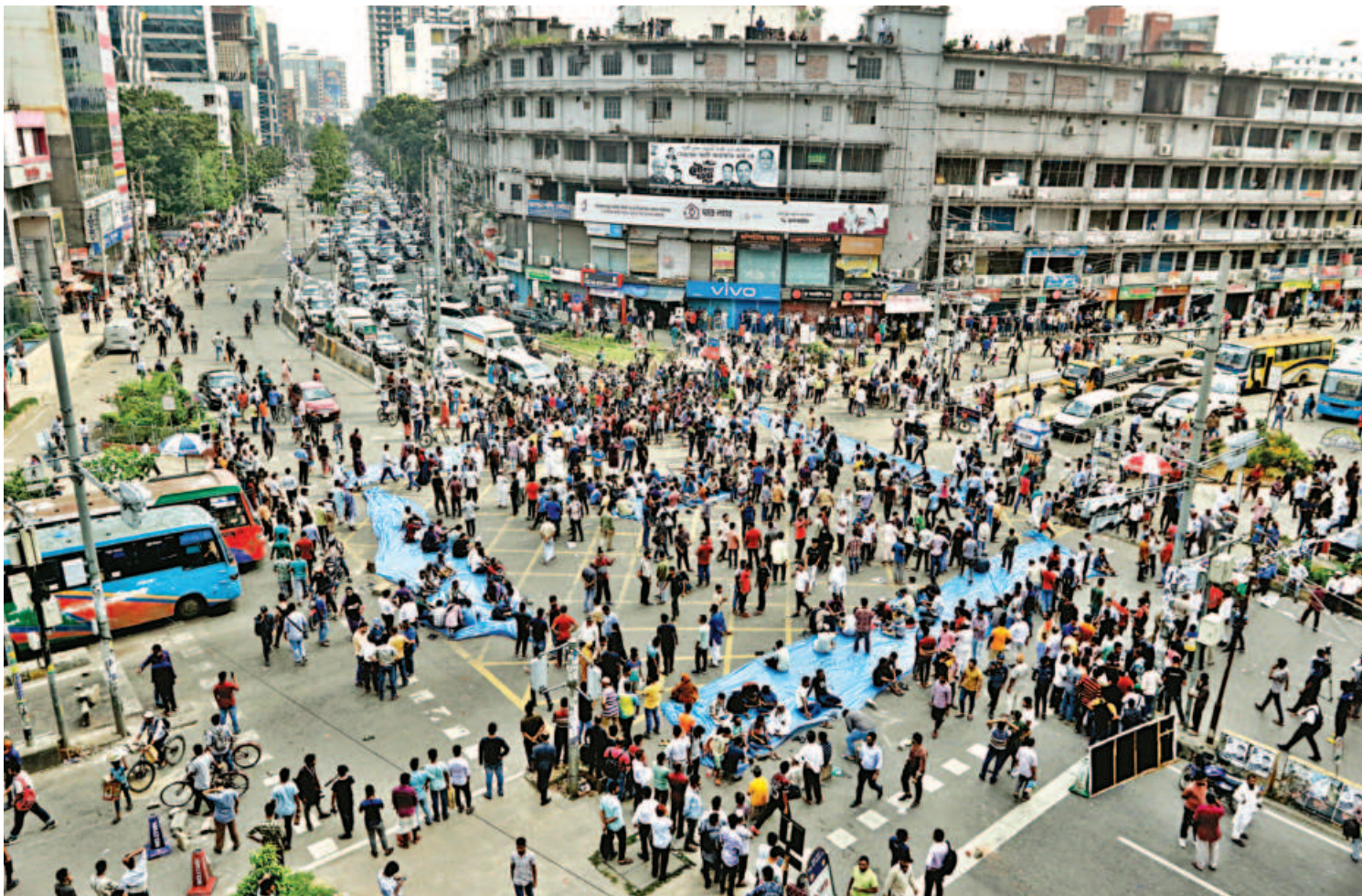
Shop owners and their employees block Gulshan-1 intersection yesterday after the Dhaka North City Corporation sealed off the adjacent Gulshan Shopping Centre which was declared risky earlier. The demonstration led to huge tailbacks in Gulshan, Banani, and nearby areas. Story on page 2.