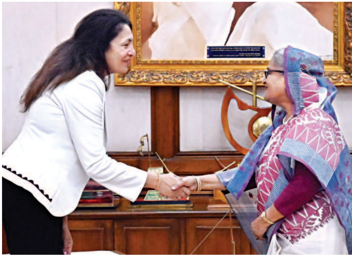
Uzra Zeya, US under secretary for civilian security, democracy, and human rights, calls on Prime Minister Sheikh Hasina at the Gono Bhaban. The senior American diplomat discussed elections and Rohingya crisis, among other issues, with the premier yesterday.