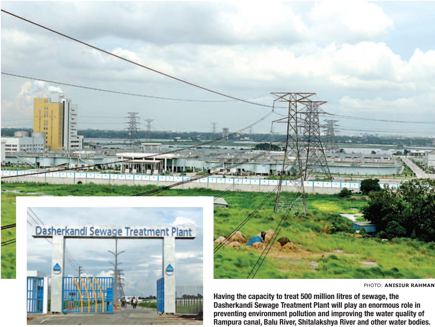
Having the capacity to treat 500 million litres of sewage, the Dasherbandi Sewage Treatment Plant will play an enormous role in preventing environment pollution and improving the water quality of Rampura canal, Balu River, Shitalakshya River and other water bodies.

STAR REPORT Prime Minister Sheikh Hasina is set to inaugurate the recently completed modern and environment-friendly Dasherbandi Sewage Treatment Plant (STP) in Dhaka today, the largest of its kind in South Asia. The Dasherbandi Sewage Treatment Plant is the first modern STP and also the first modern sludge drying-incinerator in Bangladesh as well as the largest single sewage treatment plant in South Asia. Having the capacity to treat 500 million litres of sewage, the modern plant will play an enormous role in preventing environment pollution and improving the water quality of Balu and Shitalakshya rivers, Rampura canal and other water bodies. The plant was constructed on the east of Aftabnagar area, reports UNB. In the plant, some 45 tonnes of fly ash will be generated from sewage sludge a day, which can be used as raw materials in cement factories. The Dasherbandi STP will treat sewage coming from a number of the city's areas, including Tejgaon, Niketan, Badda, Banani, Gulshan (part), Banani, Ramna, Eskaton, Nayatola, Moghbazar, Wireless, Mouchak, Outer Circular Road, Mohanagar Housing, Hatirjheel, Kalabagan and Dhanmondi (part). The plant will be able to treat 20-25 percent of the 2,000 million litre sewage generated in Dhaka. The plant was constructed as part of a master plan taken up by Wasa to construct five STPs to treat 100 SEE PAGE 4 COL 5