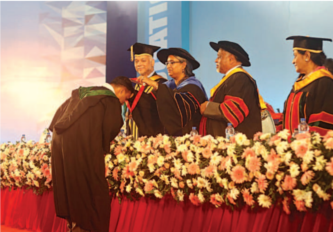
Education Minister Dipu Moni awarding a student at the 24th convocation of North South University at Bangabandhu Bangladesh-China Friendship Exhibition Centre in Dhaka yesterday.