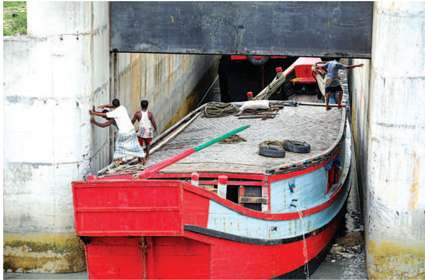
A boat struggling to pass through an under-construction sluice gate at the estuary of Chaktai Khal (canal). Boats ply this canal to carry goods to different areas. But the sluice gate is so narrow that boatmen find it very difficult to navigate their way through it. The photo was taken in Chattogram city's Firingibazar area yesterday afternoon.