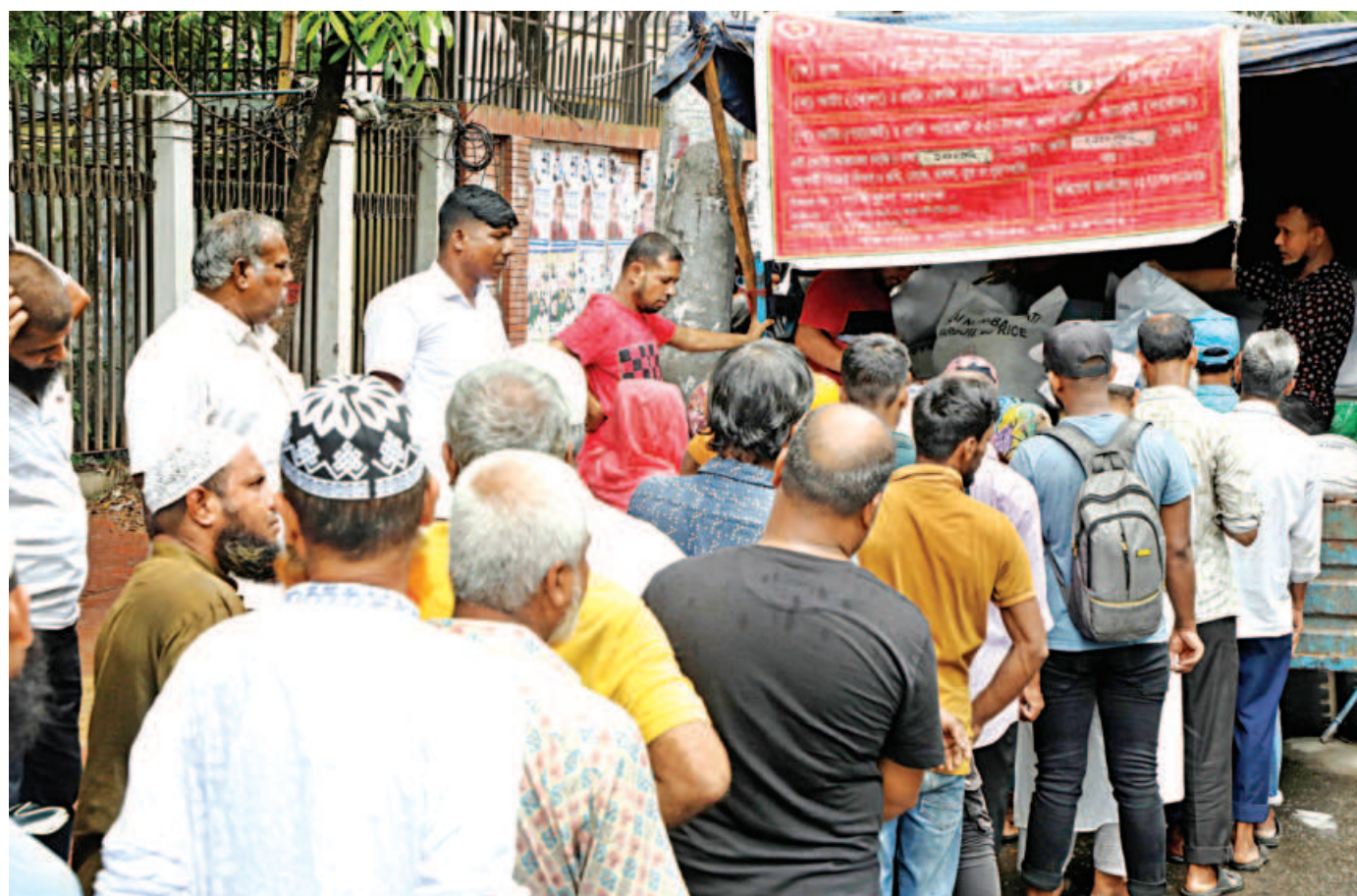
People queue up in front of an OMS truck near the Secretariat to purchase essentials at reduced prices. Sales of OMS products resumed here on Sunday after Eid. Due to soaring prices of essentials, the number of people buying OMS products is increasing. The photo was taken around 11:30am yesterday.

With all the momentum in the bag, an upbeat Afghanistan will be at more ease going into the contest, while the unwanted record of a whitewash at home looms large for the Tigers.