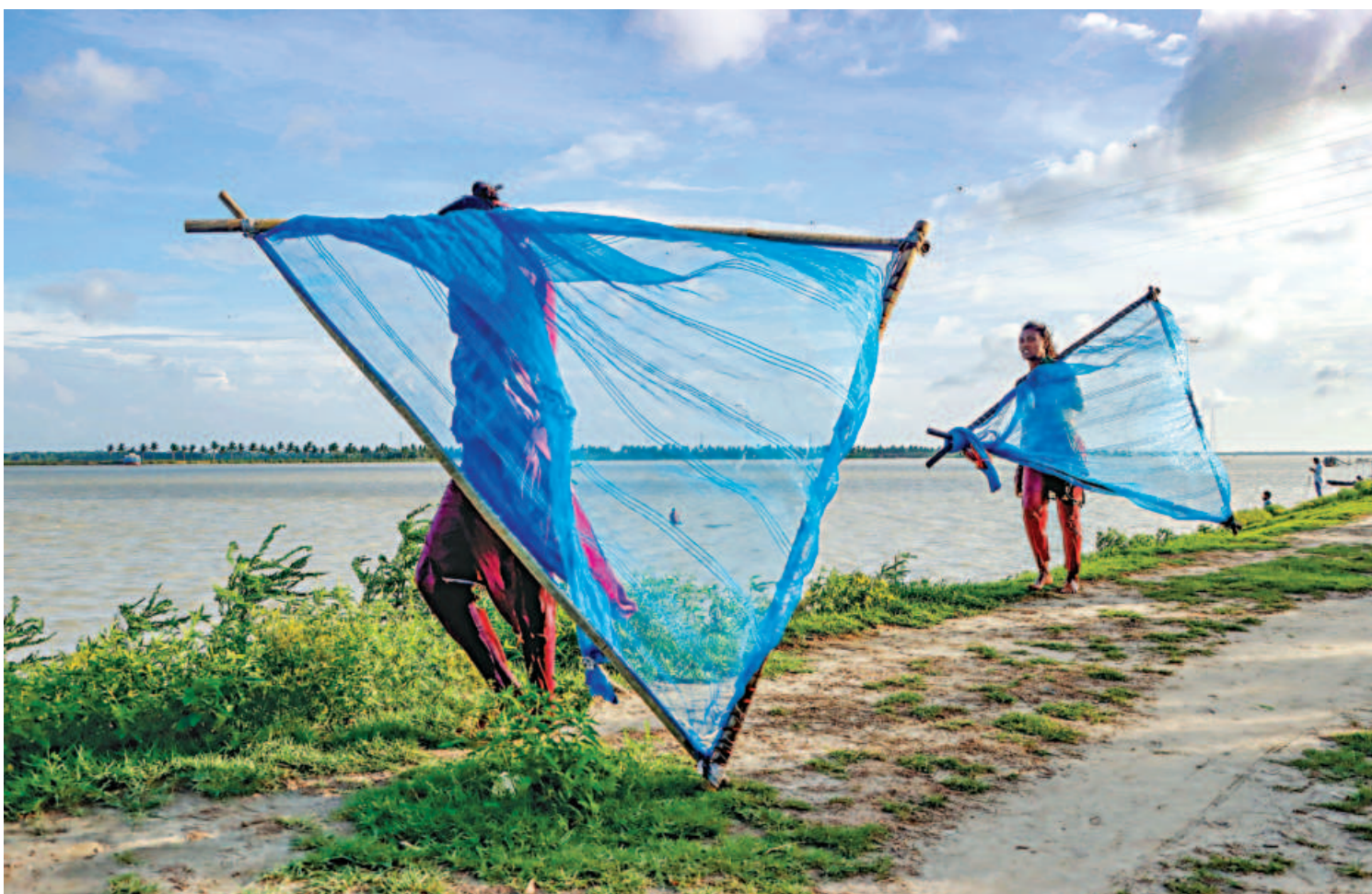
Two young girls carry their fishing nets on their way to catch Horina prawns, a variety commonly found during high tide in the Rupsha. Many residents of Lobonchora Mathabhanga area near Khulna's Rupsha Bridge earn a living by catching prawns and selling them to the local markets. The photo was taken yesterday.