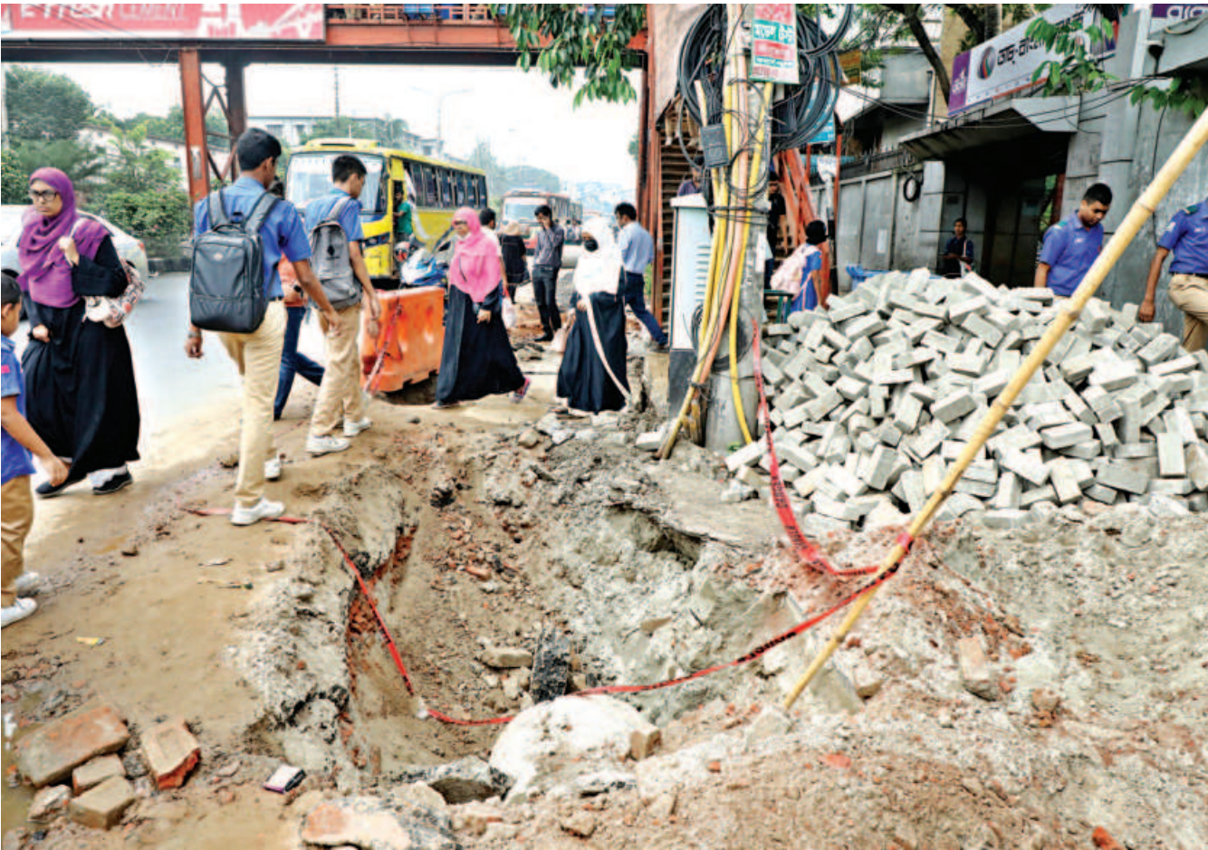
Pedestrians, especially school-goers, are facing difficulties crossing the Jahangir Gate area as construction materials for installing sewerage pipes have been left on the pavement. The photo was taken yesterday.