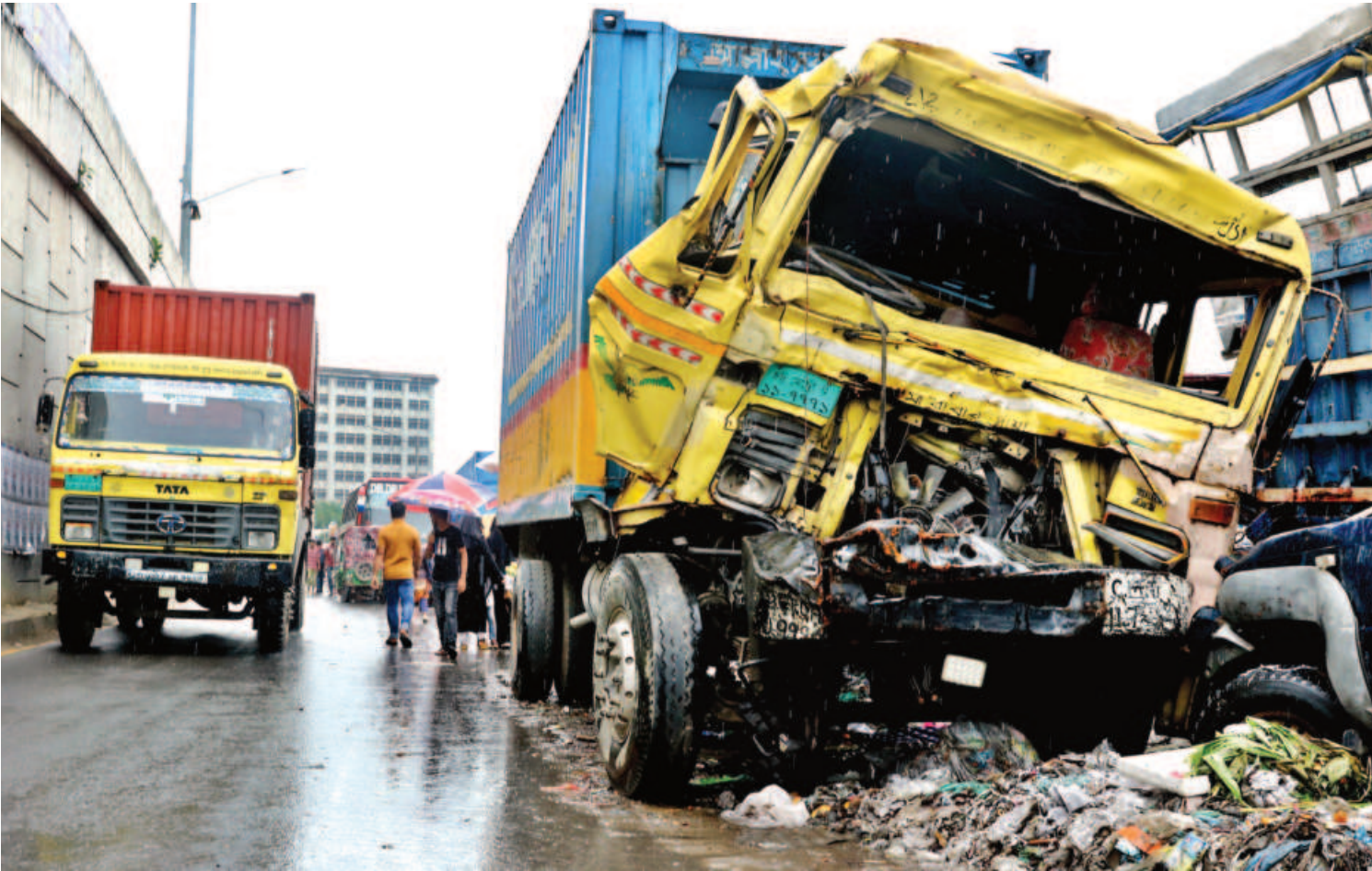
Vehicles damaged in crashes have been left on Dhaka-Chattogram highway in Narayanganj's Kanchpur even though there is a designated spot near Kanchpur Highway Police Station to keep those. Occupations of road space in this manner disrupt traffic. The photo was taken yesterday.