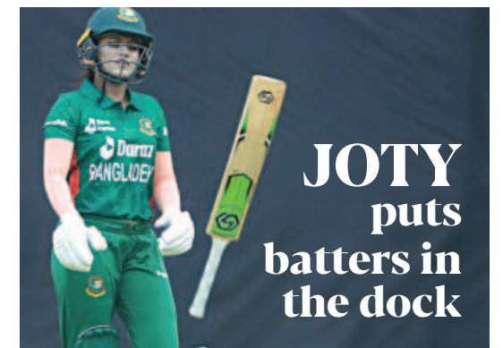
JOTY puts batters in the dock

"This is time for you to do your job and I hope you will be very serious about it. If you do your job properly and play well, money will fly in," the BFF boss concluded.