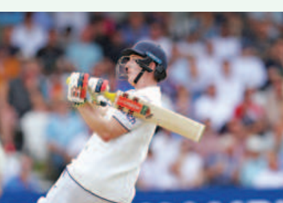
Mark Wood and Chris Woakes have their arms raised in joy as England celebrate a much-needed victory in the third Ashes Test against Australia by three wickets at Headingley yesterday to stay alive in the five-match series, trailing 2-1 with the next match scheduled to start on July 19 at Old Trafford. [Inset] Although Harry Brook could not stay till the end, it was his 75 that had kept the hosts alive earlier on the fourth day.