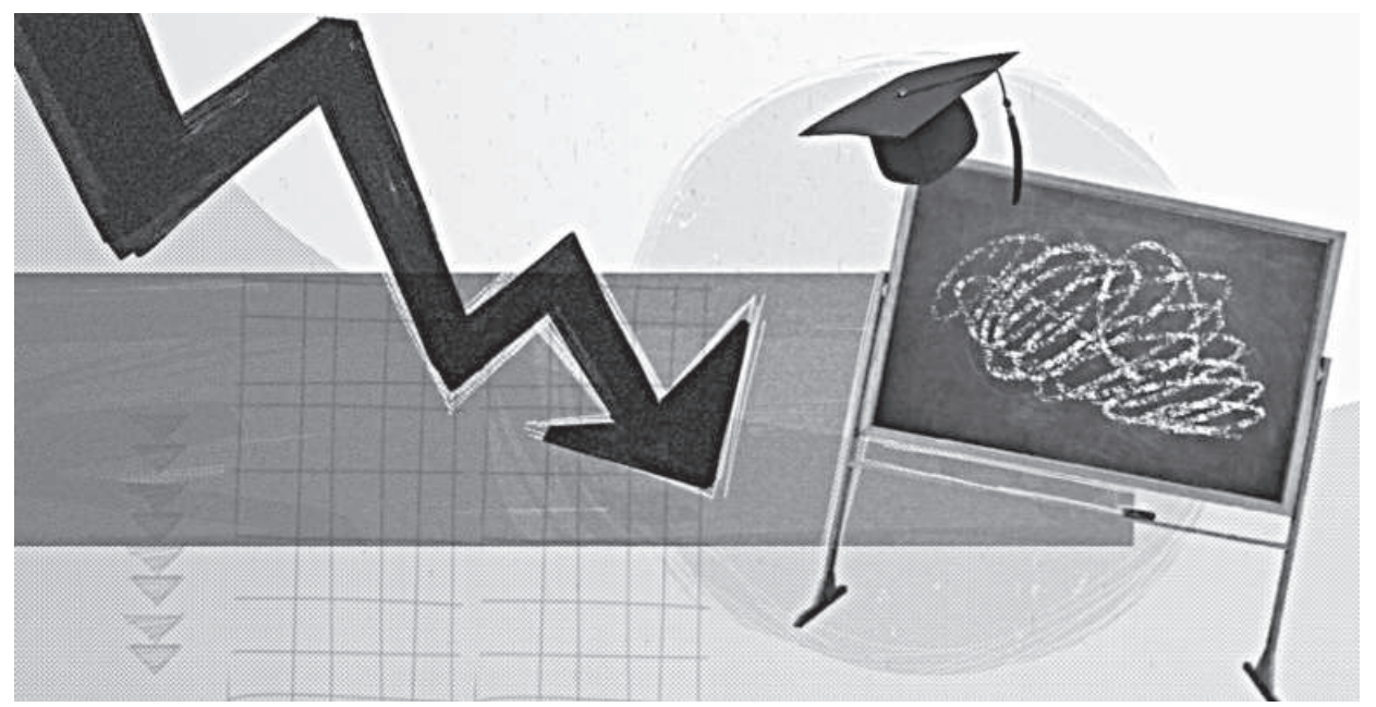
VISUAL: REHNUMA PROSHOON

We will definitely do a pilot project before going for synchronisation. Besides, the remote control that was given to the police previously was not synchronised, and they could control the signals manually through the remote. After a while, they just returned to their old system of using sticks. We will set up a central control room through which to control the entire signalling system. If we become successful, then Dhaka will get a modern traffic movement system after a long time.