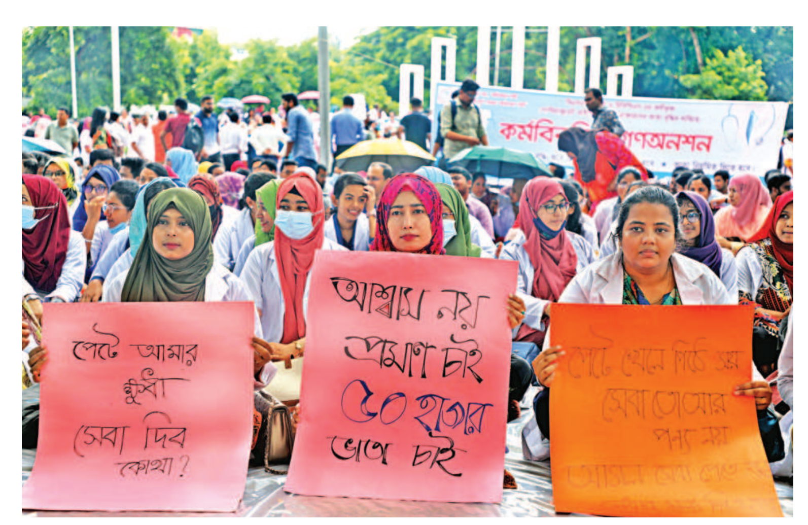
Postgraduate private trainee doctors continue their countrywide strike, demanding a hike in their monthly stipends to Tk 50,000 from Tk 20,000. Postgraduate trainee physicians are medical school graduates who pursue further specialised training in a specific medical field for 2-5 years to achieve higher degrees. The photo was taken at Central Shaheed Minar in Dhaka yesterday.

The law minister also said the government has not written any letter for quick disposal of the pending cases against the BNP leaders. "The judiciary is independent. We have not written such a letter. If they can show such a letter, arguments will take place on it."