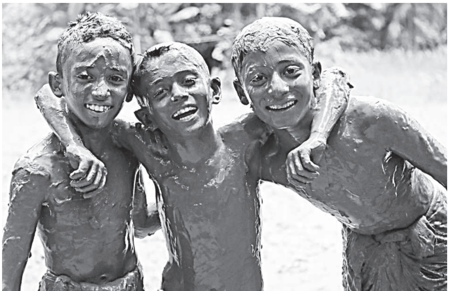
THE CLAY-PLAY... Three friends hug each other following a football session in a field in Pirojpur's Kuniari area. Their mud-covered faces beamed with joy as they took a small break from the game and posed for this photo yesterday.