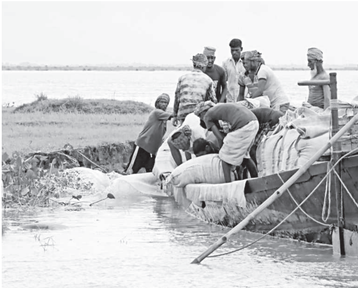
Geo bags are being deployed onto the banks of the eroding Padma in Faridpur. The woes of locals began on June 26 when the river first engulfed a significant number of houses and agricultural lands, leaving many with nothing left to salvage.