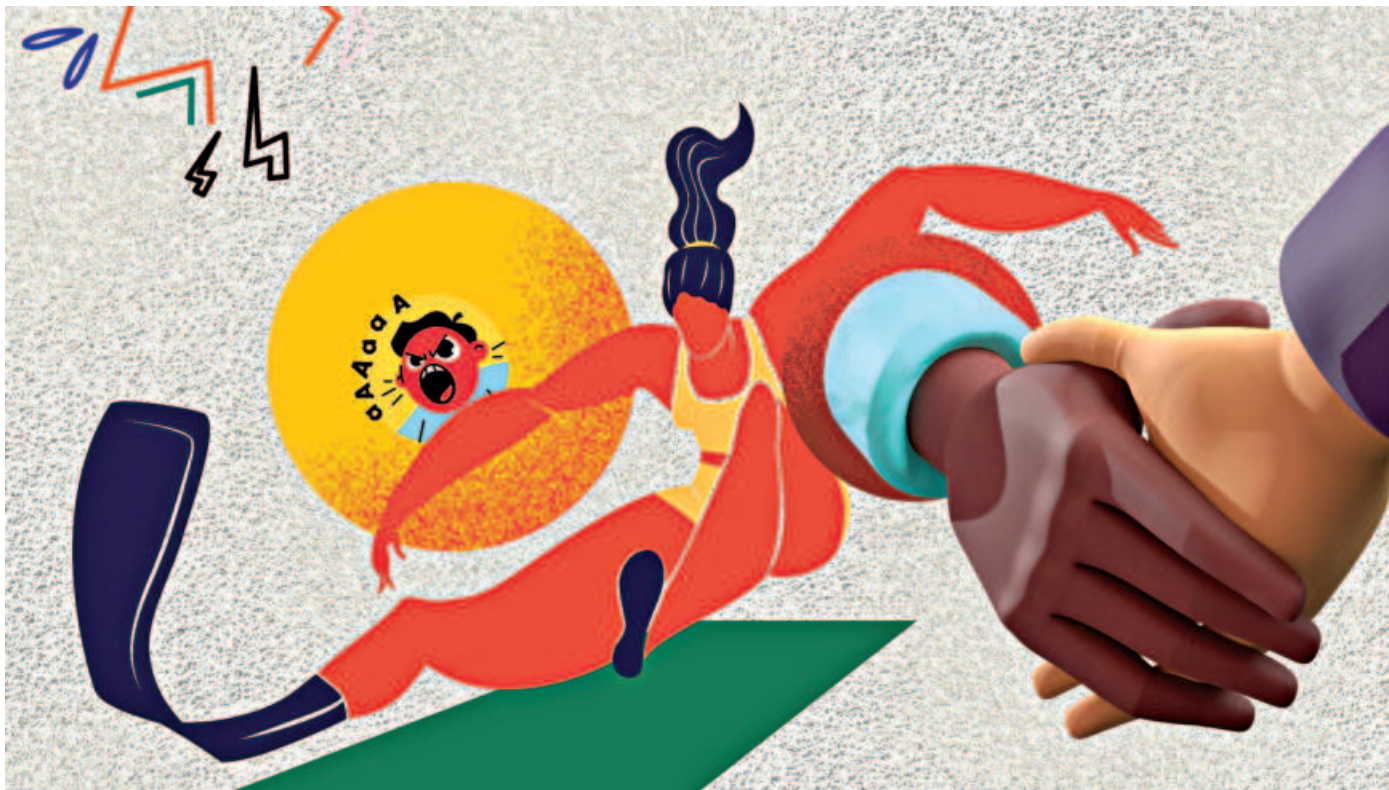
ILLUSTRATION: ZARIF FAIAZ

long run, enriching you with the ideas and motivation needed to avoid future obstacles. Keep in mind that professional networking is a two-way street - if you are taking help from others, be sure to offer support back and be as proactive as you can to keep yourself well-known in your professional circle.