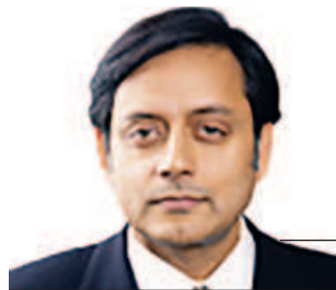
Shashi Tharoor, a former UN under secretary-general and former state minister, is an MP for the Indian National Congress. He is the author, most recently, of 'Ambedkar: A Life.'