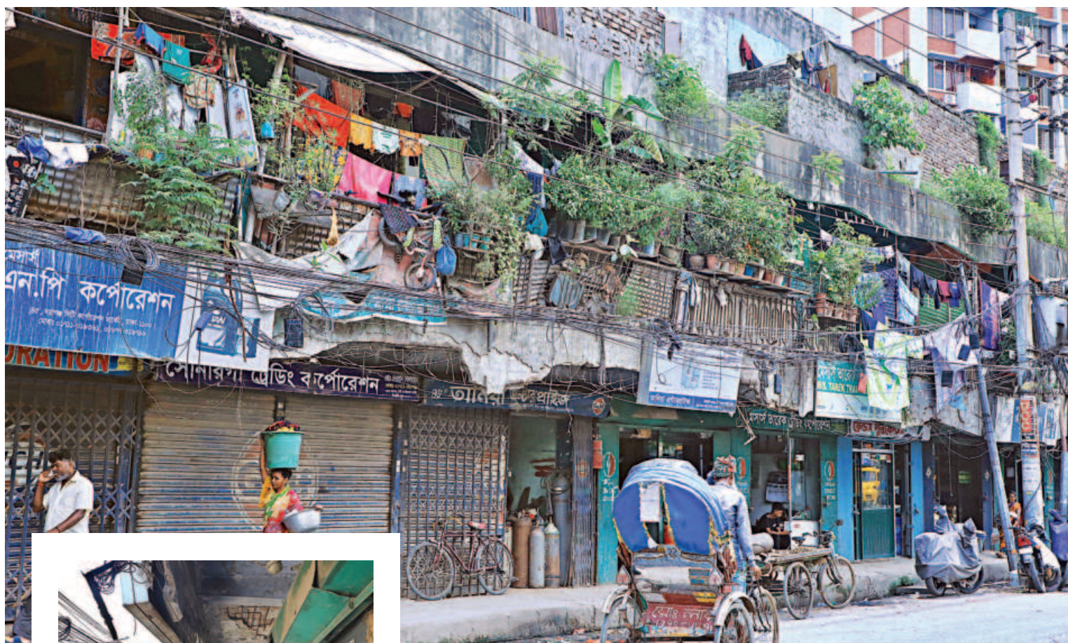
Dayaganj City Corporation Market, which houses shops and residents, has been in a dilapidated condition for a long time. According to locals, the building needs urgent repairs but the authorities concerned continue to turn a blind eye to the situation. Inset, plasters have fallen off the building's ceiling in many places, which locals said have already injured a few.