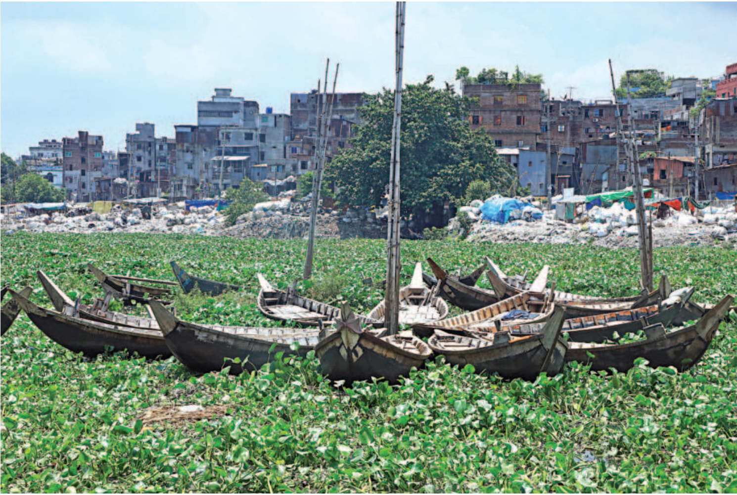
Water hyacinth drapes the Buriganga, making it difficult for boats to ply. Heaps of plastic illegally dumped on the riverbanks further afflict the waterbody. The photo was taken yesterday in the capital's Kamrangirchar.