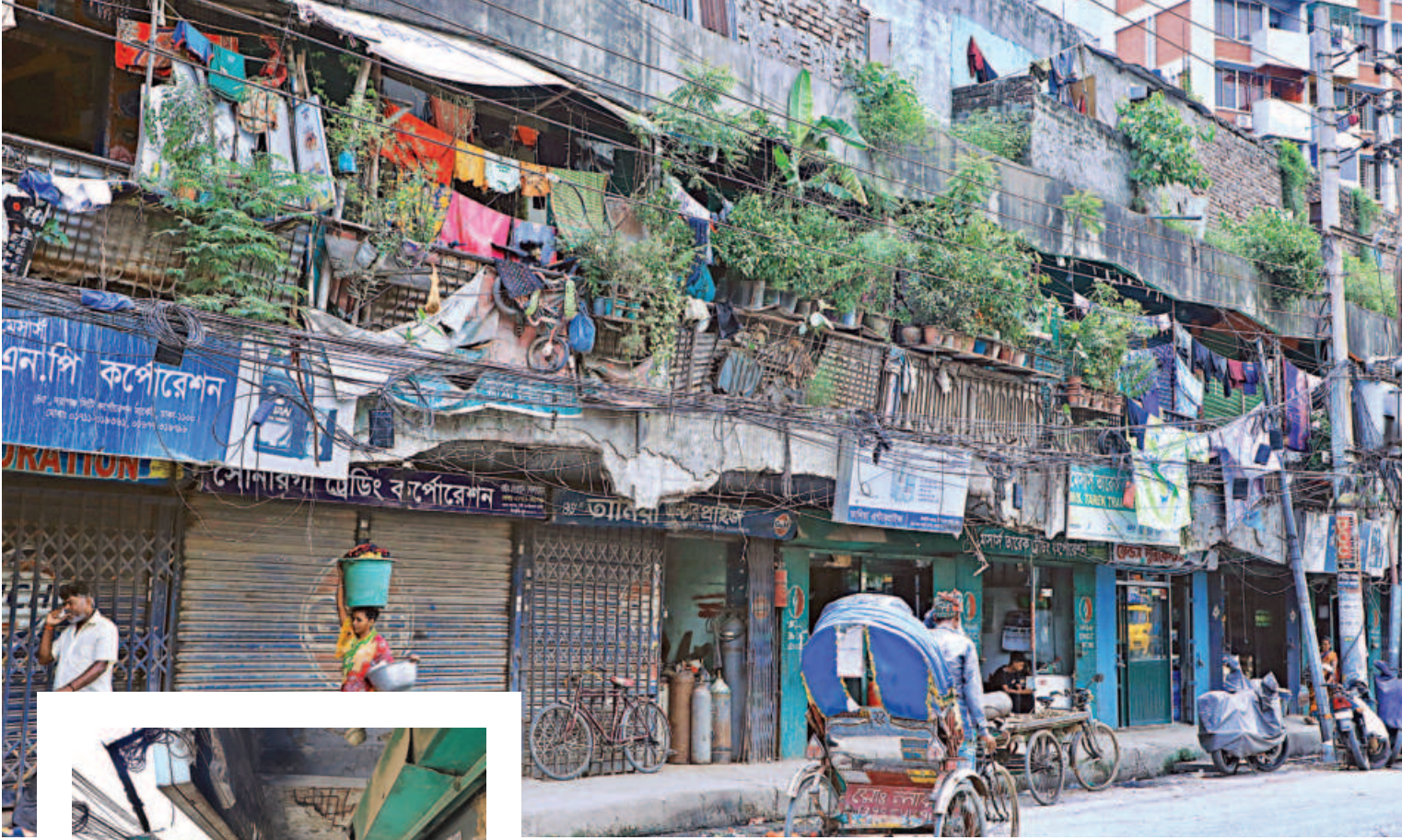
Dayaganj City Corporation Market, which houses shops and residents, has been in a dilapidated condition for a long time. According to locals, the building needs urgent repairs but the authorities concerned continue to turn a blind eye to the situation. Inset, plasters have fallen off the building's ceiling in many places, which locals said have already injured a few.

Ahead of the upcoming national election, the ruling Awami League will conduct a month-long programme to highlight the government's "successes and achievements" in the last fifteen and a half years before people. The decision was taken in a joint meeting held by AL's Dhaka city (north and south) units and its associate organisations at the party's Gulistan headquarters in the capital. Programme schedule for the mourning month of August was also decided at the meeting, two AL central leaders told The Daily Star. Wishing anonymity, a joint general secretary of the party said, "We will carry out countrywide mass-campaigns only after the month of mourning is over." Besides, the ruling party leaders asked the presidents and general secretaries of three associate fronts to immediately form their full-fledged committees. Prior to the meeting, AL General Secretary Obaidul Quader said BNP is now busy with complaining to foreigners. "The election is three or four months away... But the BNP and its like-minded parties are not going to the voters, instead they are looking at the foreigners... They are daydreaming," said Quader while briefing reporters. Mentionable, the ruling AL has been holding "counter programmes" for the last couple of months since BNP started series of anti-government rallies from December 10 last year.